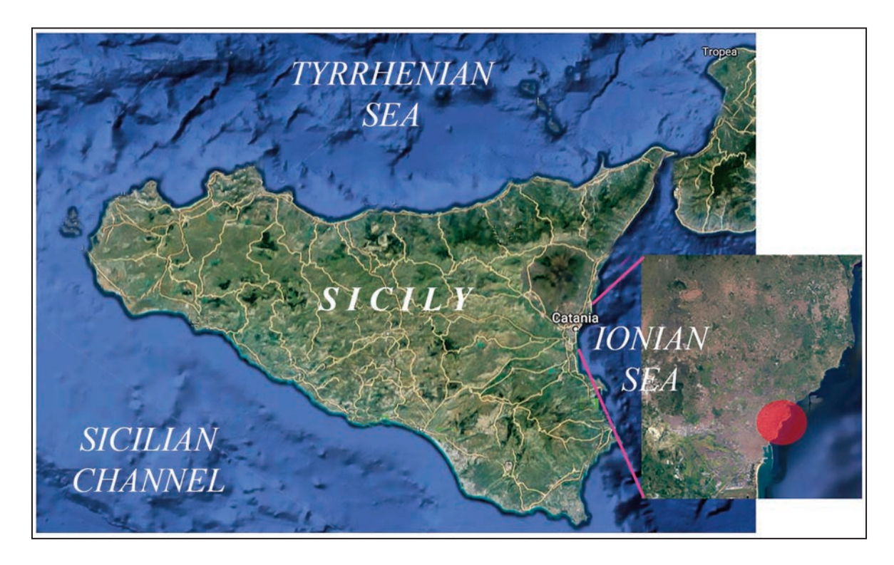
Figure 1. Map illustrating the collecting locality of Isognomon legumen in eastern Sicily (red spot).

The Sicilian material was compared to specimens collected in the Persian Gulf (PMC) and to specimens of I. australica from Karpatos, Greece,