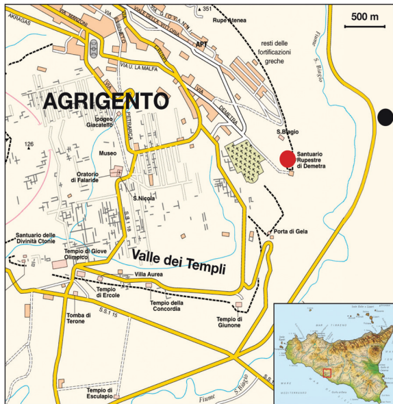
Figure 1. Distribution of the Rupestrella populations surveyed near Agrigento (southern Sicily). Black circle: site identified by the authors; red circle: site studied by Beckmann (2002).

The population object of this note was found on a limestone cliff located 3 km ESE of Agrigento (Fig. 1), 160 m a.s.l. (Municipality of Agrigento, AG), UTM 33S UB7729, where it lives together