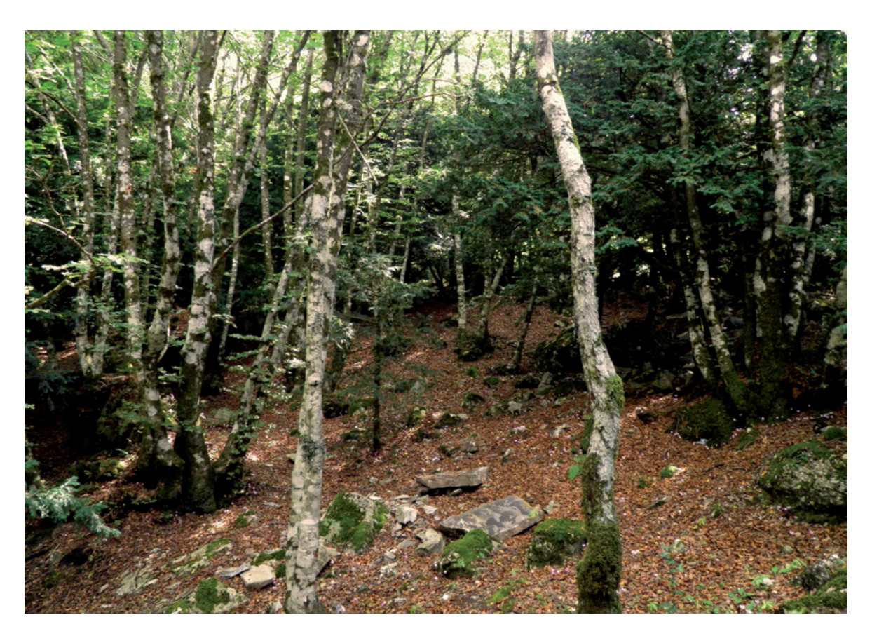
Figure 9. View of the Bosco Tassita (Nebrodi Mts.) as an example of possible (re-)introduction area of Zelkova sicula according to assisted colonisation

instance, it has been suggested that the extant distribution of Z. carpinifolia is probably also due to the rather inefficient dispersal mechanisms that may have hindered its expansion from Pleistocene refugia to Holocene alluvial plains in the Colchic lowlands (Denk et al., 2001). The situation of the Sicilian species is even more dramatic, given its ineffectiveness to regenerate through seeds that makes its dispersal impossible over long distances.