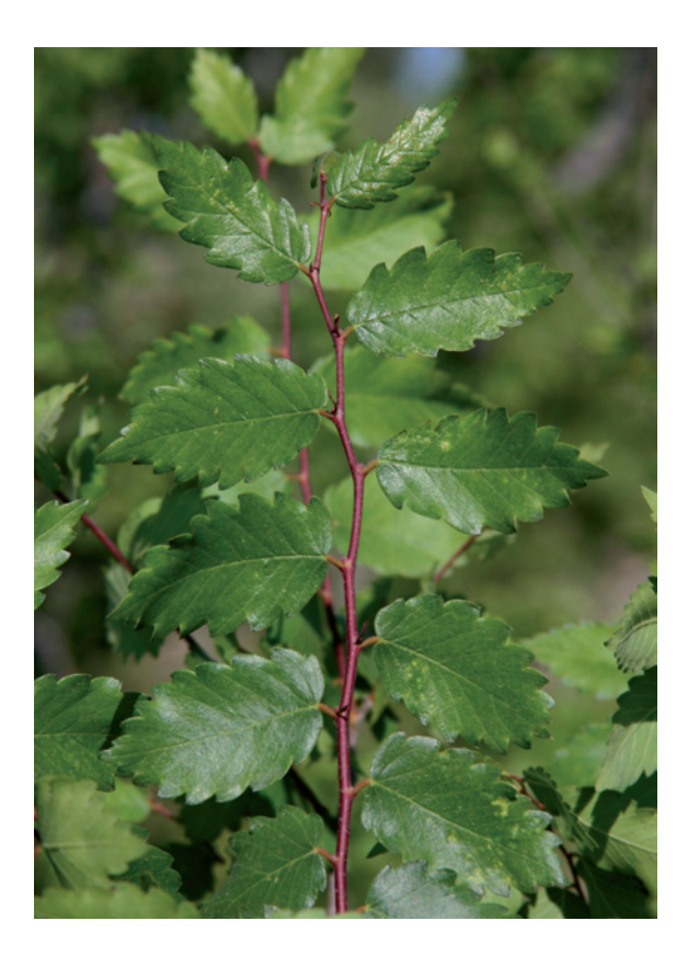
Figure 1. Branchlet of Zelkova sicula.

Up to very recent times the Sicilian species was known to consist worldwide of only a single population (hereinafter referred as ZS1) of about 250 trees, included in a small area less than 0.4 hectares within the Bosco Pisano, in the Iblei Mts. At the end of 2009 a second population (hereinafter ZS2) was