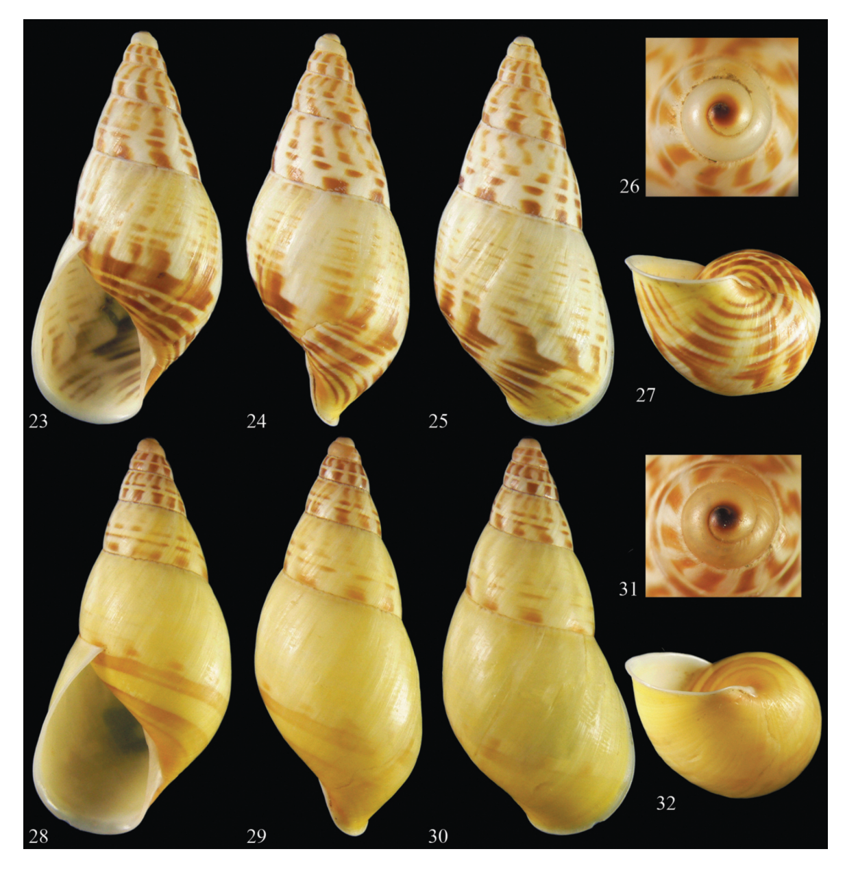
Figures 23-32. Shells of Amphidromus abbasi , forest in Langgaliru, southwest part of Sumba island, East Nusa Tenggara, Indonesia (-09°45'44"N, 119°38'33"E) (DC RGA698).