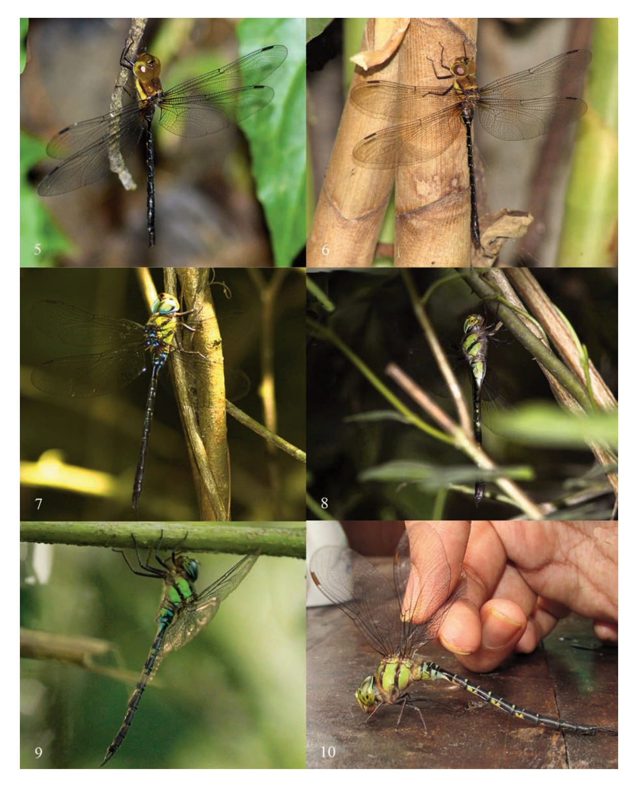
Figures 5–10. Gynacantha khasiaca . Fig. 5: Gynacantha khasiaca male (Ramnagar, Purba Medinipur, West Bengal, 14.IX.2015): Young male shows brown morph. Fig. 6: Gynacantha khasiaca female (Cooch Behar Purba, West Bengal, 12.VII.2015): Young female shows brown morph. Fig. 7: Gynacantha khasiaca male (Deo Pahar, Golaghat, Assam, 06.X.2014): dorsal-lateral view. Fig. 8: Gynacantha khasiaca female (Ramnagar, Purba Medinipur, West Bengal, 21.IX.2015): lateral view. Fig. 9: Gynacantha khasiaca male (Murti River, Gorumara National Park, West Bengal, 18.XI.2014): lateral view. Fig. 10: Gynacantha khasiaca male (Siliguri, West Bengal, 06.VIII.2015): lateral view.