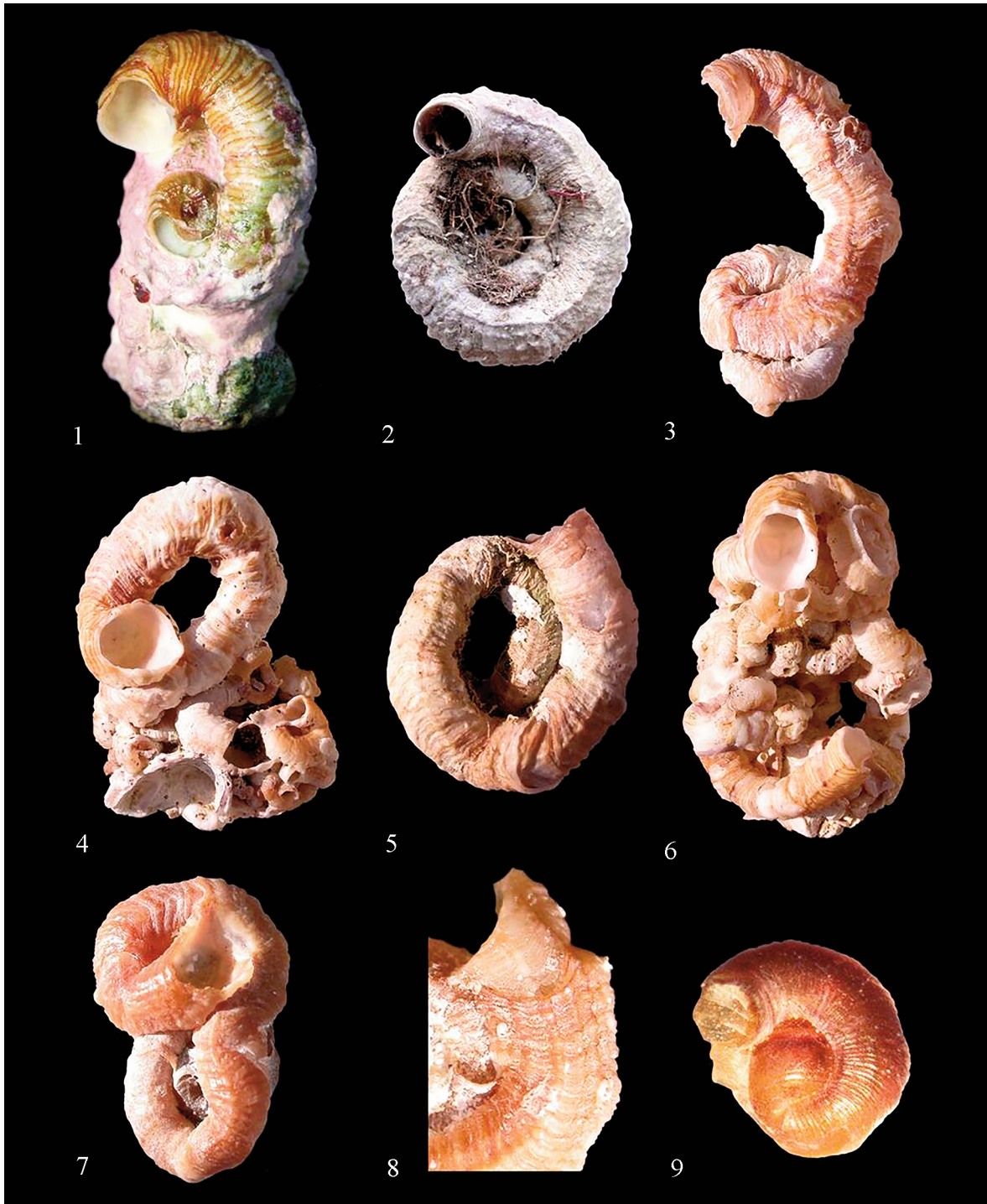
Figures 1–9. Vermetus bieleri n. sp. Fig. 1: holotype, Funchal, Madeira, length 12.1 mm. Fig. 2: paratype 1, same data of holotype, length 21.4 mm (MMF). Fig. 3: paratype 6, Las Palmas, Gran Canaria, Playa del Hombre, length 22.0 mm (DSC). Fig. 4: paratype 7, same data of paratype 6, length 33.5 mm (FSC). Fig. 5: paratype 8, same data of paratype 6, length 25.1 mm (RBINS). Fig. 6: paratype 9, cluster of a ten of sh from Las Palmas, Gran Canaria, Playa del Hombre, length 38.0 mm, (RDPC). Fig. 7: shell of a not fully grown specimen, paratype 10, same data of paratype 6, length 14.0 mm, external Ø of the tube 3.1 mm (RBINS). Fig. 8: detail of the shell sculpture of a not fully grown specimen. Fig. 9: detail of the first telewhorl, same data of paratype 6, length 1.2 mm, Ø of the tube 0.5 mm (DSC).