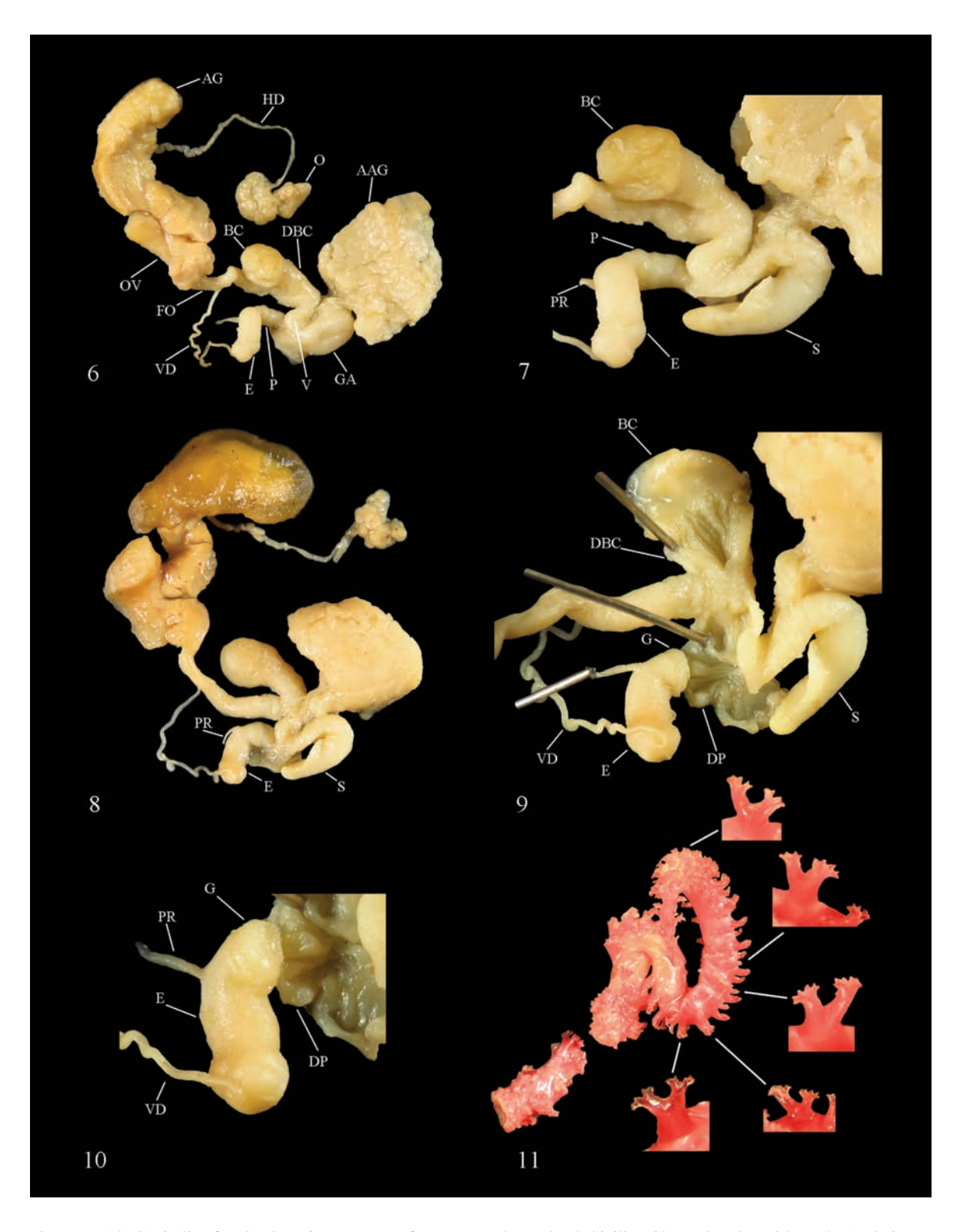
Figures 6–10. Genitalia of Milax lopadusanus n. sp. from Lampedusa Island (Sicilian Channel, Italy) without the "gelatinous substance". Fig. 6: genitalia (CL 17517). Fig. 7: idem, with stimulator outside the genital atrium. Fig. 8: genitalia (holotype NMBE 553145). Fig. 9: idem, internal structure of atrium, penis, vagina and duct of the bursa copulatrix; Fig. 10: penial papilla of holotype (NMBE 553145). Fig. 11: spermatophore of M. lopadusanus n. sp. with enlargements of some isolated spines (CL 13406).