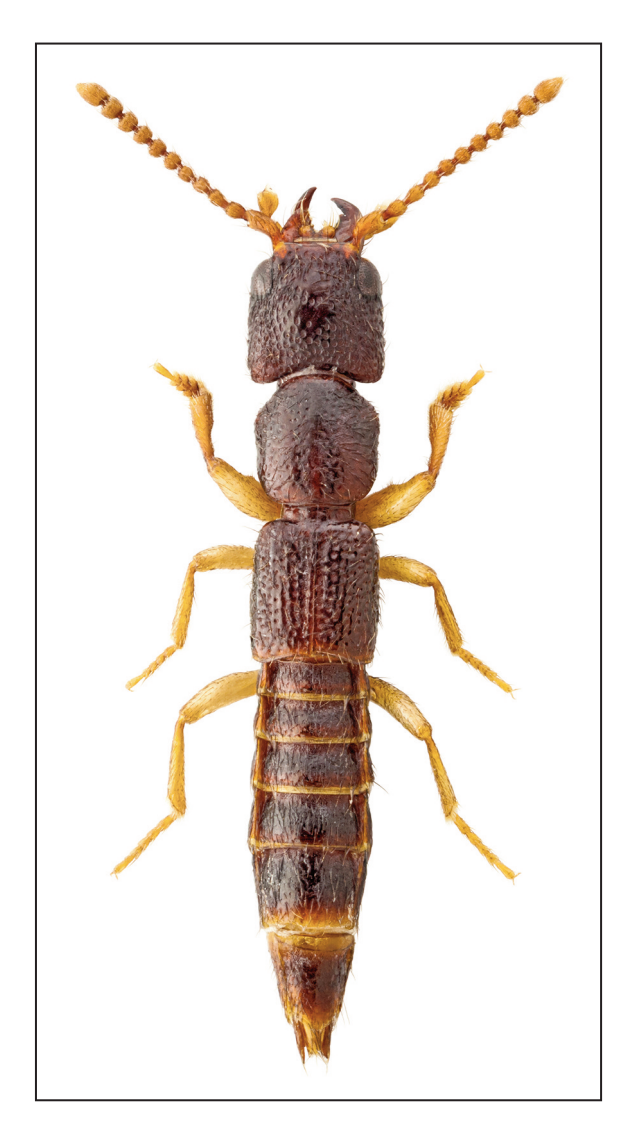
Fig. 1. Stereocephalus agostii n. sp., holotype.

TYPE LOCALITY. Paraguay: Departamento Cordillera, Salto Piraretá, 25°30'S, 56°55'W.