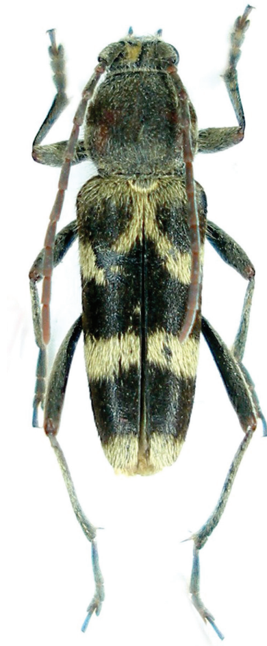
Figure 3. Chlorophorus oezdikmeni n. sp. holotype male.