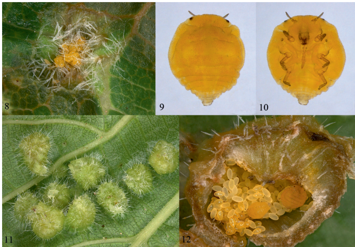
Figures 8-12. Daktulosphaira vitifoliae (Sternorrhyncha Phylloxeridae) (= Phylloxera vastatrix Planchon, 1868). Fig. 8. Opening of the gall on the upper surface of the leaf showing the eggs of the gallecoles. Figs. 9, 10. Gallecole, dorsal (9) and ventral (10) views. Fig. 11. Leaf-galls proliferate on the underside of the leaf. Fig. 12. Section of a gall containing eggs and gallecoles.

New invasions of insect pests in Sardinia have accelerated dramatically over the last few years. Some particularly harmful species arrived between 1995 and 2000, many after 2000. Often these new pests attack and destroy ornamental plants which have become part of the Sardinian landscape, causing it to change; just as often their presence requires methods of pest management which are different from the traditional methods on specific crops; finally in at least one case (the Asian Tiger Mosquito) they pose a threat to our health. The most significant examples are listed.