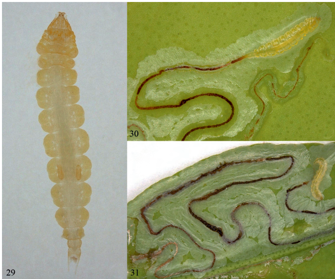
Figures 29-31. The Citrus Leafminer, Phyllocnistis citrella (Lepidoptera Gracillariidae), a small moth from Asia. Fig. 29. Magnification of the larva. Figs. 30, 31. Mine and larva on the underside of the leaf.

In other words, cultural changes. Other times they could even lead to deeper changes. What will happen to the palm-lined city streets, balconies flowering with geraniums, pine-woods? A great deal will depend on our ability to manage these problems.