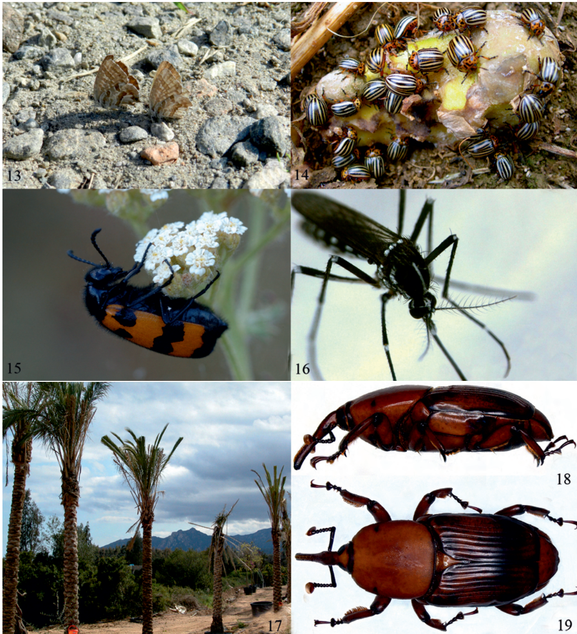
Figures 13-19. Many kinds of invaders. Fig. 13. The Geranium Bronze Butterfly, Cacyreus marshalli (Lepidoptera Lycaenidae), a recent “urban” invader from South Africa: two old specimens drinking from the soil moisture. Fig. 14. Colorado Potato Beetle, Leptinotarsa decemlineata (Coleoptera Chrysomelidae), an old invader of Europe which never arrived in Sardinia. Fig. 15. Mylabris variabilis (Coleoptera Meloidae), a locust enemy introduced into Sardinia from Italy. Fig. 16. Aedes albopictus (Diptera Culicidae), an invader with public health implications: adult female. Figs. 17-19. Rhynchophorus ferrugineus (Coleoptera Curculionidae), an Asiatic invader that attacks palms: damage (17) and male adult (18, 19).

cantha semipunctata (Fabricius, 1775), Australian too, and present in Europe for about thirty years (Tassi, 1970; Cavalcaselle & Contini, 1973). A leaf-galling wasp, Ophelimus maskelli (Ashmead, 1900)