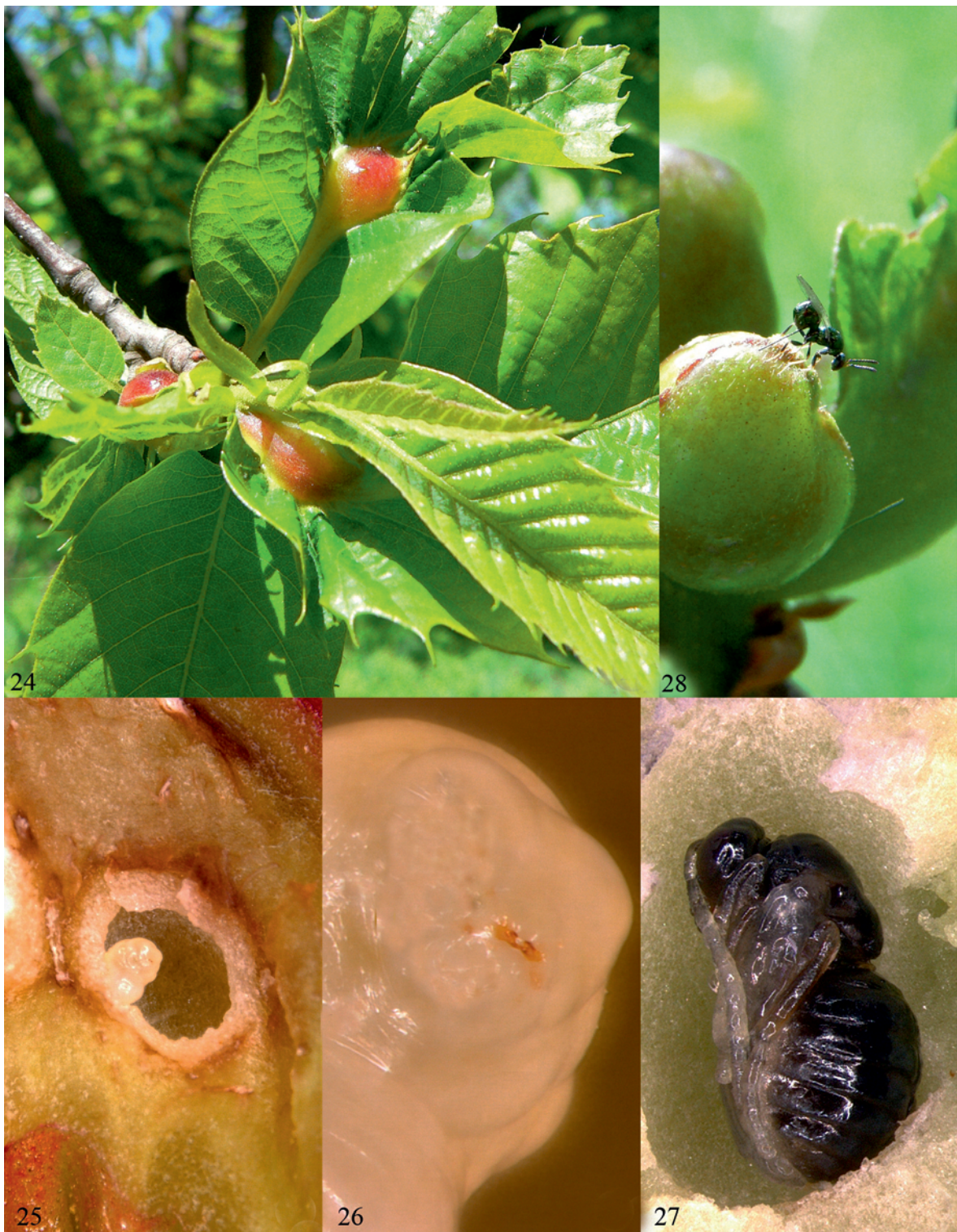
Figures 24-28. The Oriental Chestnut Gall Wasp, Dryocosmus kuriphilus (Hymenoptera Cynipidae), a parthenogenetic species attacking chestnuts that induces gall formation on shoot tips, leaves and catkins: galls (Fig. 24), section of a gall containing the larva (Fig. 25), magnification of the larva head (Fig. 26), pupa inside the gall (Fig. 27), the specific parasitoid Torymus sinensis (Hymenoptera Torymidae) parasitizing a gall (Fig. 28).