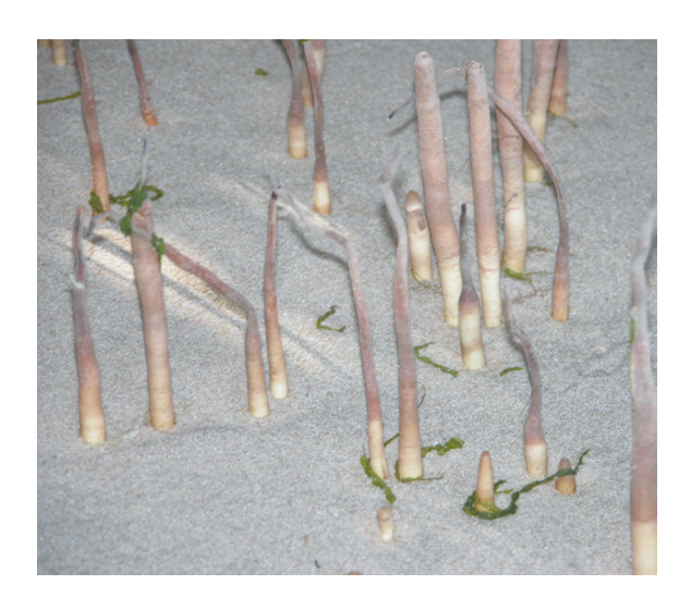
Figure 7. Close up view of healthy pneumatophores.

They are the most prominent salt-tolerant forest trees of intertidal regions; they grow in saline, anoxic soils under conditions characterized by a combination of high temperature and irradiance (Stewart & Popp, 1987; Medina, 1999). The mangroves have become the center of discussions in many coastal, environmental and pollution issues. As part of a greenery program, mangrove plantations being highly salt-tolerant, offer best chance for enhancing greenery along Kuwait's coastline depending on the natural high-low tide of seawater (Bhat et al., 2002).