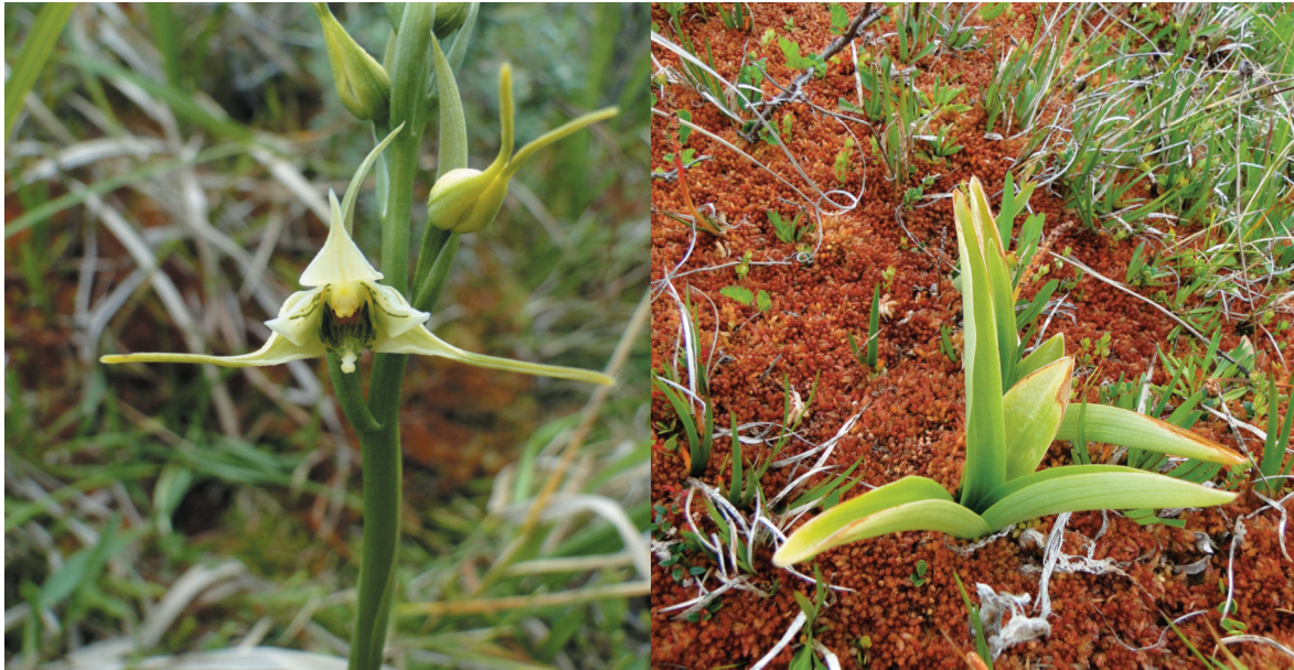
Figure 2. Gavilea araucana in inflorescence and vegetative state in a Sphagnum peatland in the Magallanes Region, Chile (Photo Erwin Domínguez, 2008).

Sphagnum peatbog next to Torres del Paine National Park, represents the first record for Chile (Fig. 2). The orchids are growing from the Sphagnum carpet (lawns and hummock) reaching between 0.25 to 0.5 m tall. Several herbaceous species are coexisting under the Sphagnum magellanicum Brid domination, including Cortaderia egmontiana (Roem. & Schult.) M. Lyle ex Connor, Senecio trifurcatus (G. Forst.) Less, Symphyotrichum vahlii (Gaudich.) GL Nesom., Hypochaeris arenaria Gaudich, Marsippospermum grandiflorum (Lf) Hook., Tetroncium magellanicum Willd., and the carnivorous plant Drosera uniflora Willd. Rhizomatous species such as Myrteola nummularia (Poir.) O. Berg and Nanodea muscosa Banks ex C.F. Gaertn. with other woody plants such as Empetrum rubrum Vahl ex Willd and Nothofagus antarctica (G. Forst.) Oerstr were also present. In these environments S. magellanicum represents 70% coverage, and grows as hummock-lawns shape with at least a two-meter peat depth and a shallow water table. This finding may provide new information about habitat types for an orchid not previously described for the rest of the country. Research on peatlands in Chile are mostly focused on flora descriptions, but this is not an adequate characterization of these ecosystems, and further studies are required to describe and quantify the Sphagnum peatland flora. Therefore, the results of these studies would not show the cur-