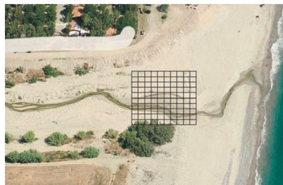
Figure 2. Location of the experimental plot for the study of larval distribution along the river.