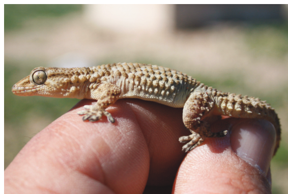
Figure 2. Tarentola fascicularis from Great Kuriat.