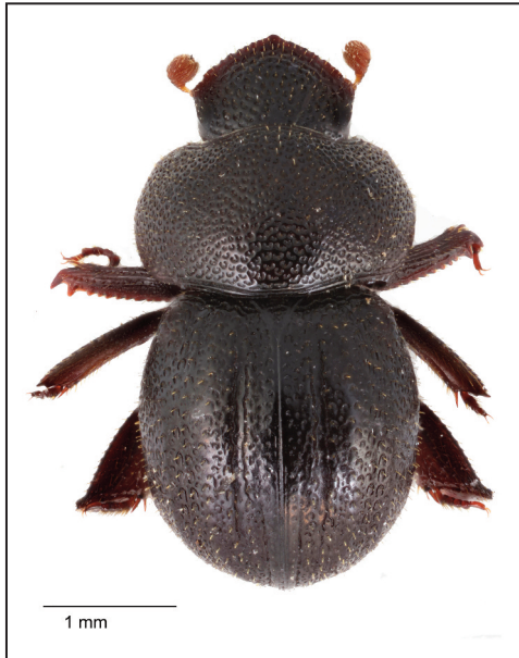
Figure 1. Madrasostes feae , specimen from Bhalukpong, habitus in dorsal view.