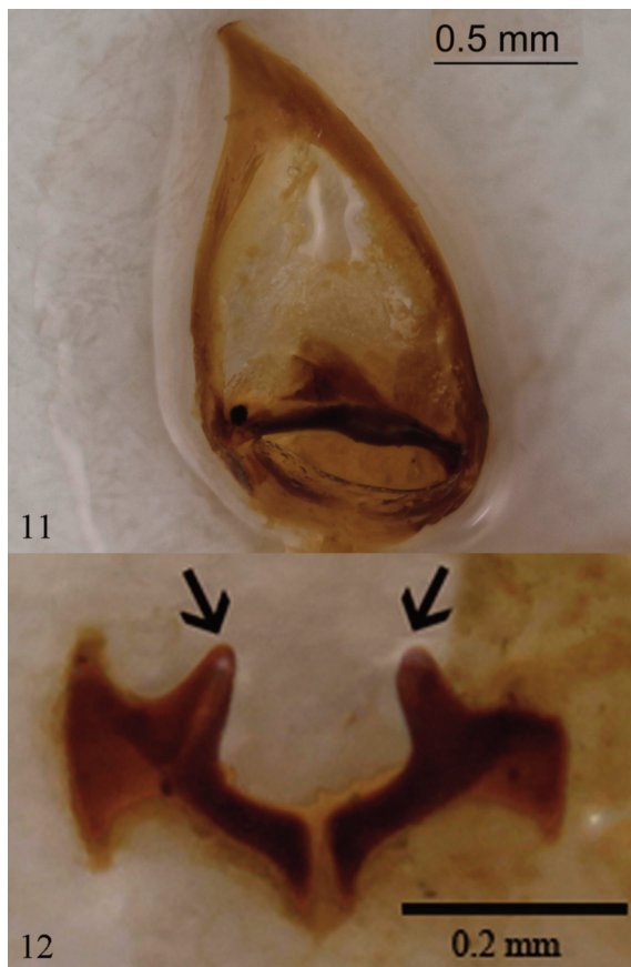
Figure 11. Pterorthochaetes dembickyi n. sp., spiculum gastrale of holotypus. Figure 12. Pterorthochaetes dembickyi n. sp., bursal sclerites of allotypus (arrows indicate the dorsal sharp projection).

forest near Etalin (Mishmi Hills), an area belonging to the Eastern Himalayan broadleaf forests ecoregion (Wikramanayake et al., 2002).