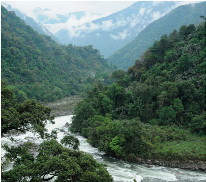
Figure 2. Pterorthochaetes dembickyi n. sp., type locality.