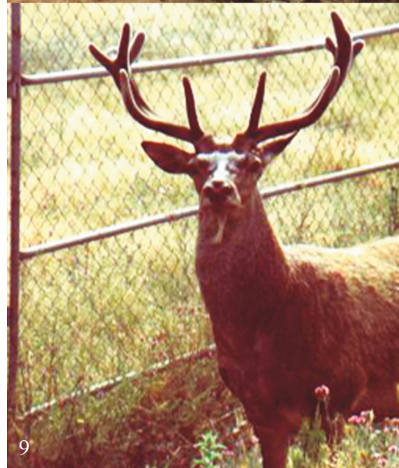
Figure 7. Delicious Lactaire; possibility of potential significant culture. Figure 8. Exploitation of light for drying of the cork. Figure 9. The Barbary stag in semi captivity.

habitants of the park but also can contribute to in the economic development of country. The knowledge of faunistic and floristic diversity and of the distribution methods of the fauna and flora of a territory,