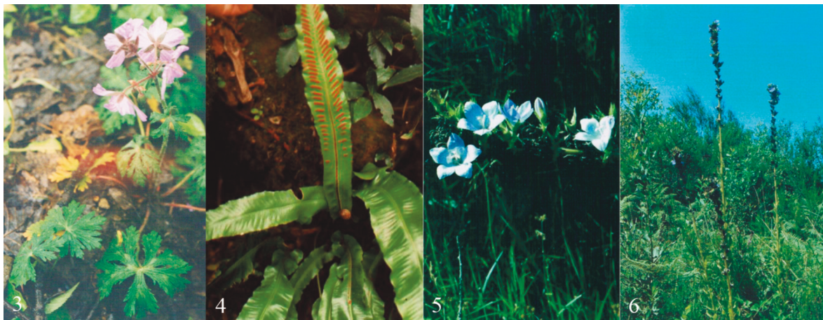
Figure 3. Geranium atlanticum B.R., endemic of N-Africa. Figure 4. Scolopendrium vulgare Sm., very rare species. Figures 5, 6. Campanula alata Desf., endemic of Algeria-Tunisia, Red List-IUCN.

mammals, insects, reptiles, Amphibians, birds and fish. We counted up to 706 animal species including the zooplankton (Table 3). The National Park of El-Kala is one of the last refuges for the stag endemic to Algeria and Tunisia. Forty years ago, there were more than 300 individuals. This number fell considerably because of the hunting and the forest fires. Currently, its number does not reach 30 individuals; maybe less. Several animal species are endemic to the region, others are more widely distributed, but they do not live any more in the area. The faunistic list can change at any moment seen the importance of the zone for its surface and ecology (Figs. 7–9).