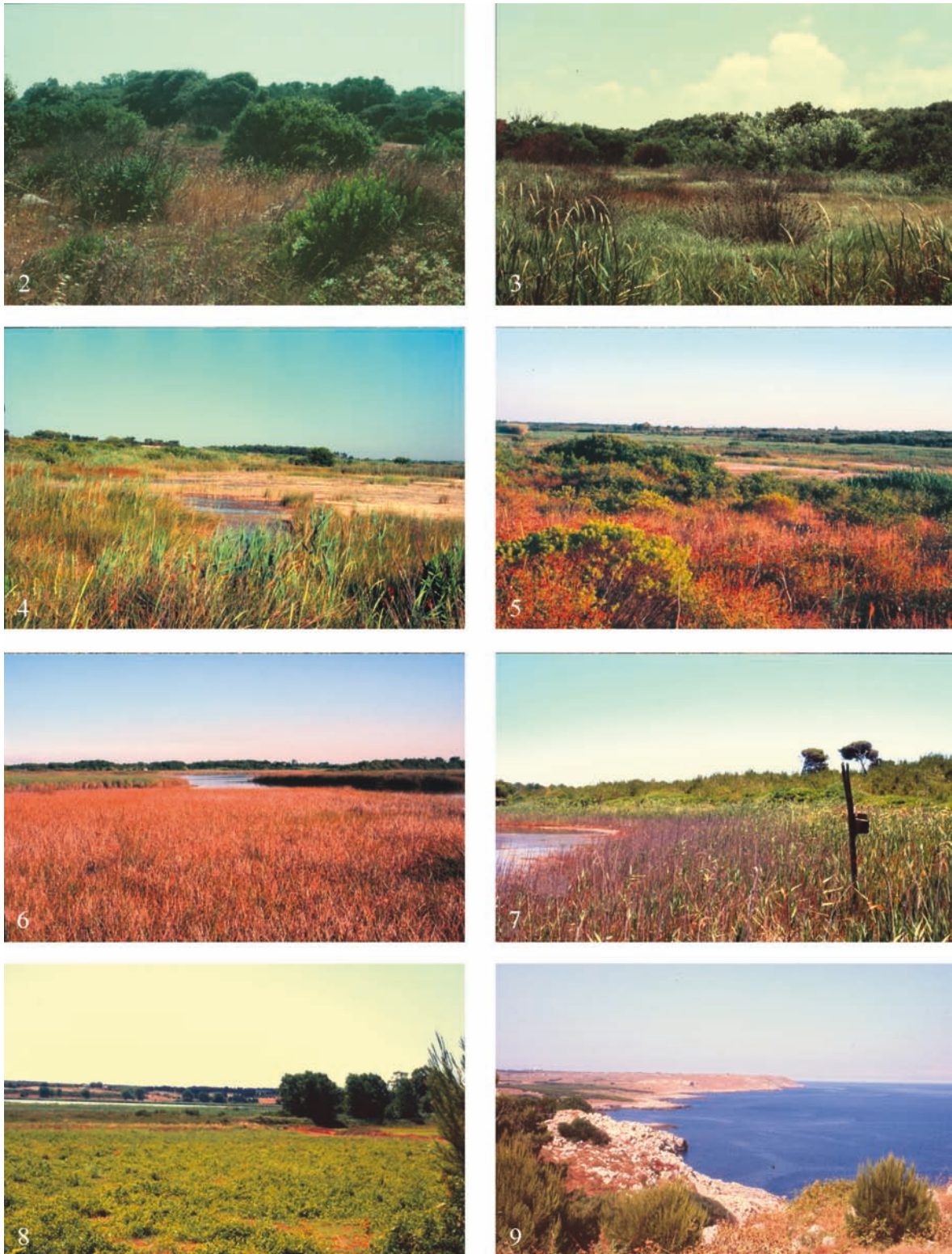
Figure 2. Bosco e Paludi di Rauccio: St. 552. Figure 3. Bosco e Paludi di Rauccio: St. 553. Figure 4. South of Bosco e Paludi di Rauccio: St. 555. Figure 5. South of Bosco e Paludi di Rauccio: St. 561. Figure 6. Le Cesine: St. 563. Figure 7. Le Cesine: St. 562. Figure 8. Laghi Alimini: St. 560. Figure 9. Porto Badisco: St. 564.