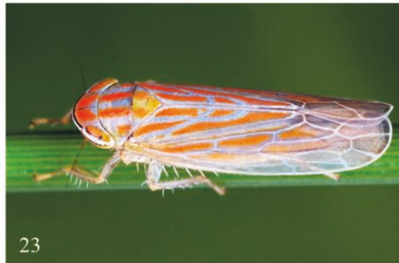
Figure 16. Stenocranus fuscovittatus . Figure 17. Euides basilinea . Figure 18. Chloriona glaucescens . Figure 19. Delphacodes capnodes . Figure 20. Ommatidiotus dissimilis . Figure 21. Varta rubrostriata . Figure 22. Parapotes reticulatus . Figure 23. Calamotettix taeniatus .