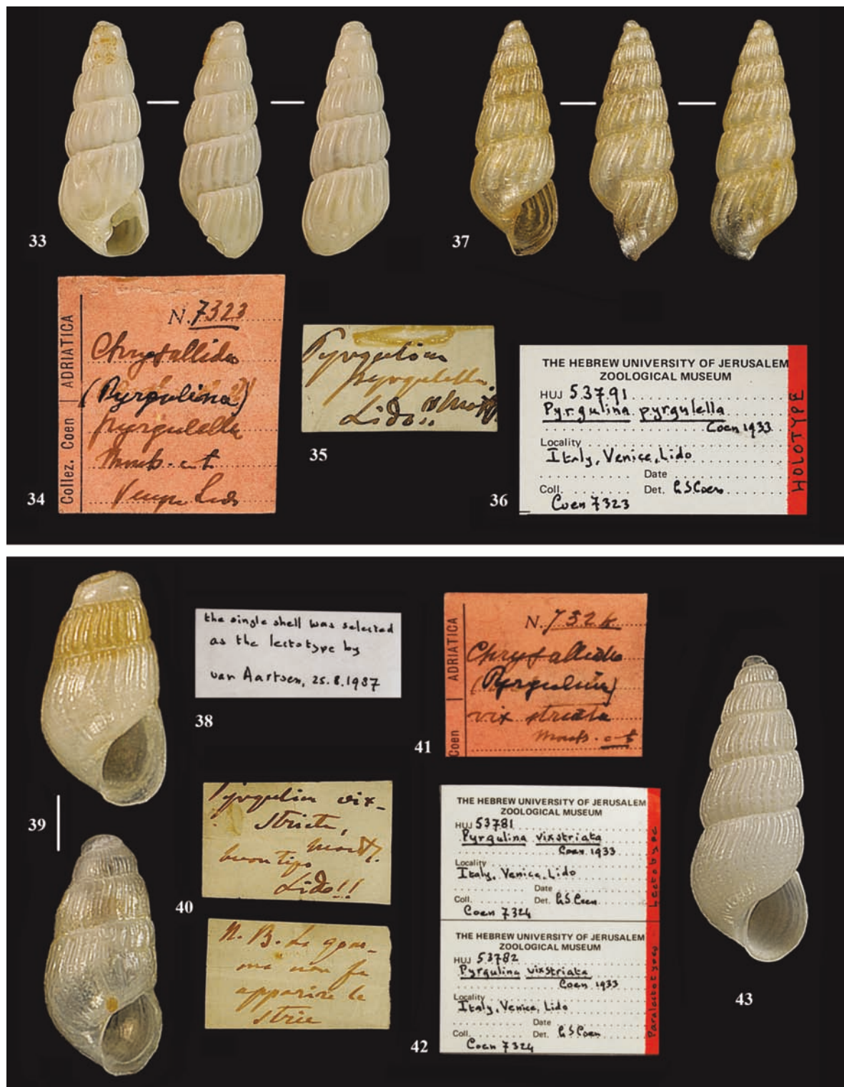
Figure 33. Pyrgulina pyrgulella Coen's collection, holotype, HUI 53791, H: 2.1 mm, Venice-Lido. Figures 34, 35. Original labels. Fig. 36. Museum's label. Fig. 37. Parthenina terebellum (Philippi, 1844). Fig. 38. Pyrgulina vixstriata Coen's collection, lectotype, HUI 53781, H: 1.3 mm, Venice-Lido. Fig. 39. P. vixstriata , paralectotype HUI 53782, H: 1.5 mm, Venice-Lido. Figures 40, 41. Original labels. Fig. 42. Museum's label. Fig. 43. Parthenina juliae (de Folin, 1872).