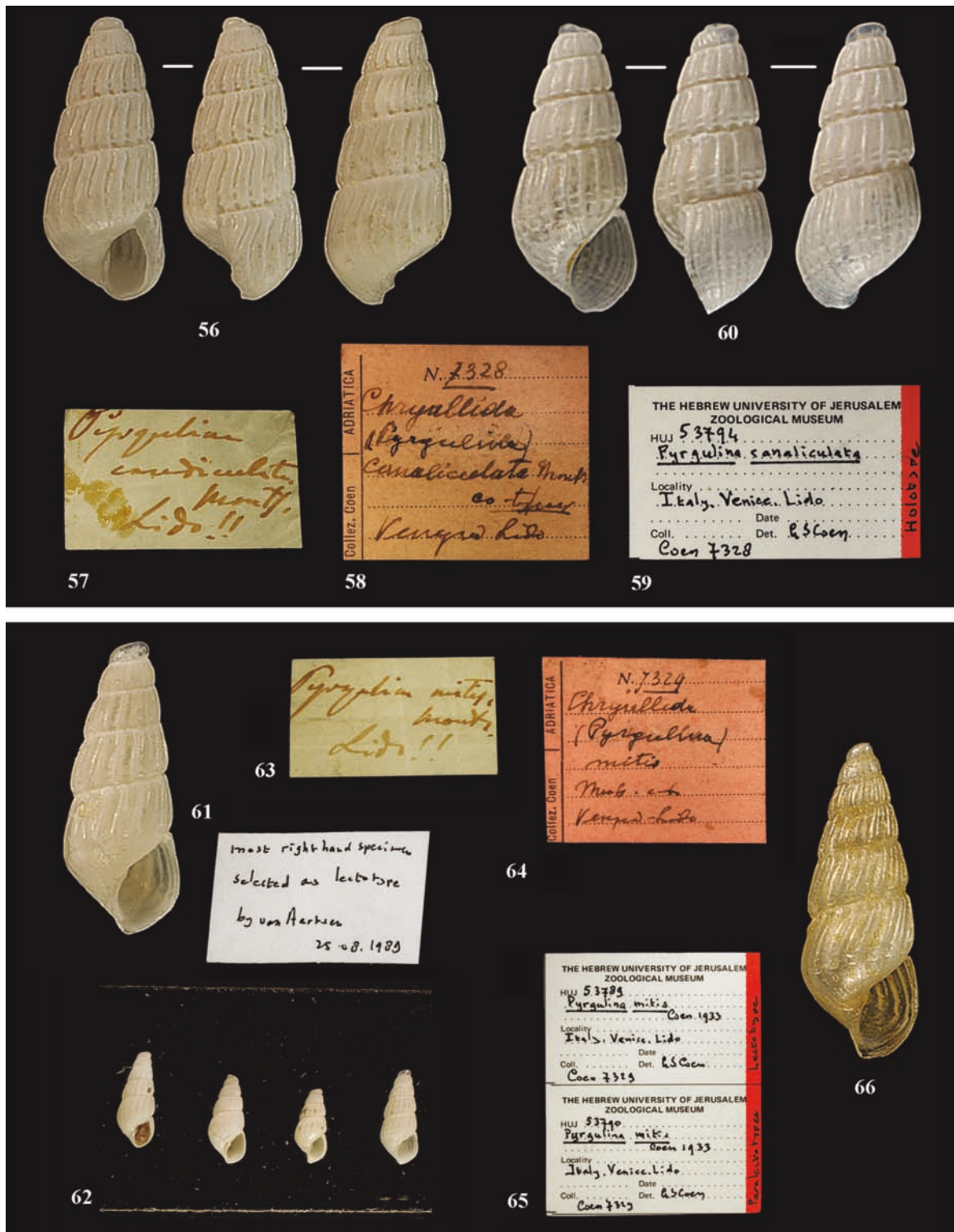
Figure 56. Pyrgulina canaliculata Coen's collection, holotype, HJ 52794, H: 1.8 mm, Venice-Lido. Figures 57, 58. Original labels. Fig. 59. Museum's label. Fig. 60. Parthenina indistincta (Montagu, 1808). Figs. 61, 62. Pyrgulina mitis Coen's collection, lectotype, HJ 53789, H: 1.8 mm, Venice-Lido and paralectotypes HJ 53790. Figs. 63, 64. Original labels. Fig. 65. Museum's label. Fig. 66. Parthenina terebellum (Philippi, 1844).