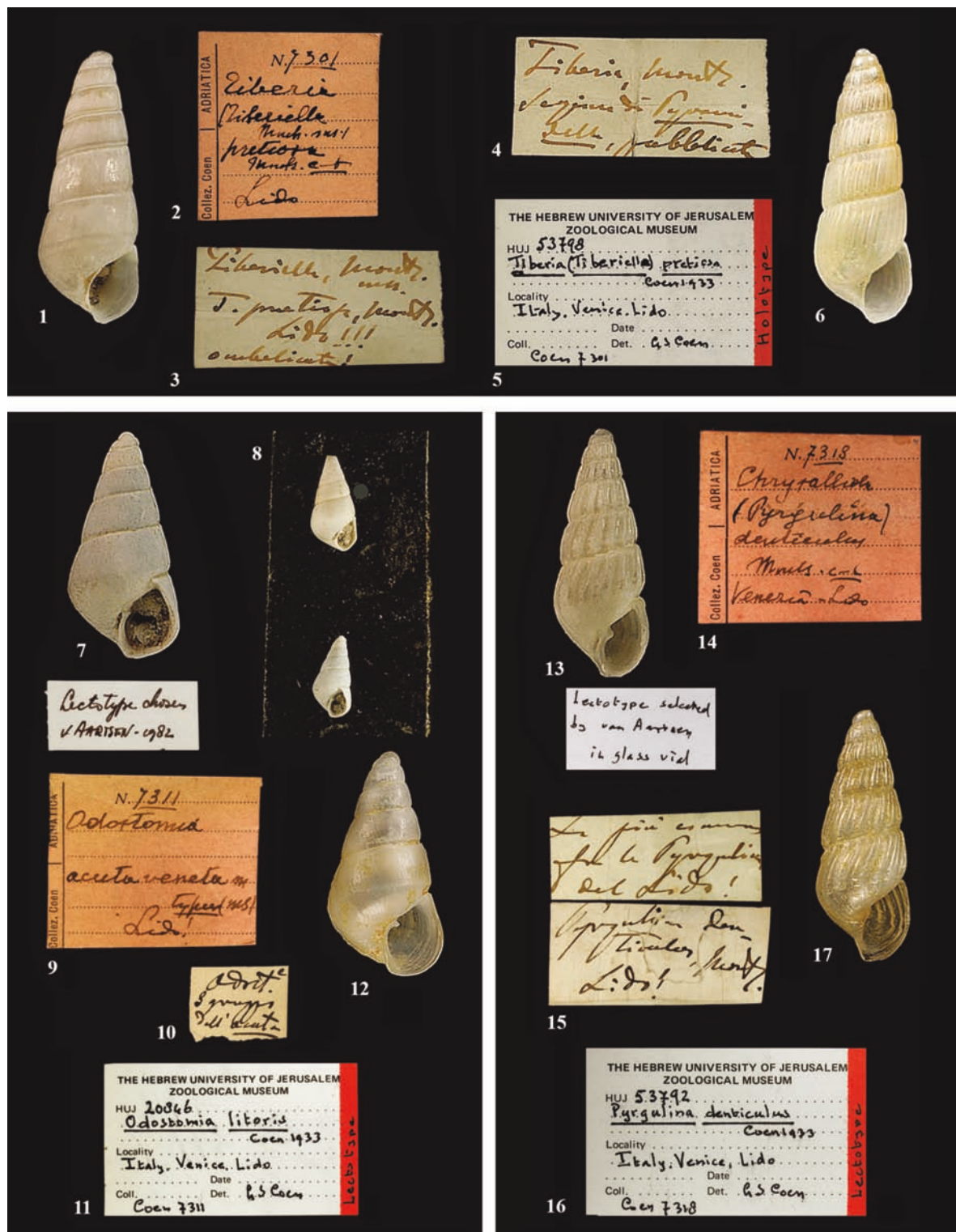
Figure 1. Tiberia (Tiberiella) pretiosa Coen's collection, holotype HUU 53798, H: 2.4 mm, Venice-Lido. Figs. 2–4. Original labels. Fig. 5. Museum's label. Fig. 6. Parthenina monterosatii (Clessin, 1900). Figs. 7, 8. Odostomia litoris Coen's collection, lectotype and paralectotype, HUU 20846, H: 2.3 mm, Venice-Lido. Figs. 9–10. Original labels. Fig. 11. Museum's label. Fig. 12. Odostomia unidentata (Montagu, 1803). Fig. 13. Pyrgulina denticulus Coen's collection, lectotype HUU 53792, H: 3 mm, Venice-Lido. Figs. 14, 15. Original labels. Fig. 16. Museum's label. Fig. 17. Parthenina terebellum (Philippi, 1844).