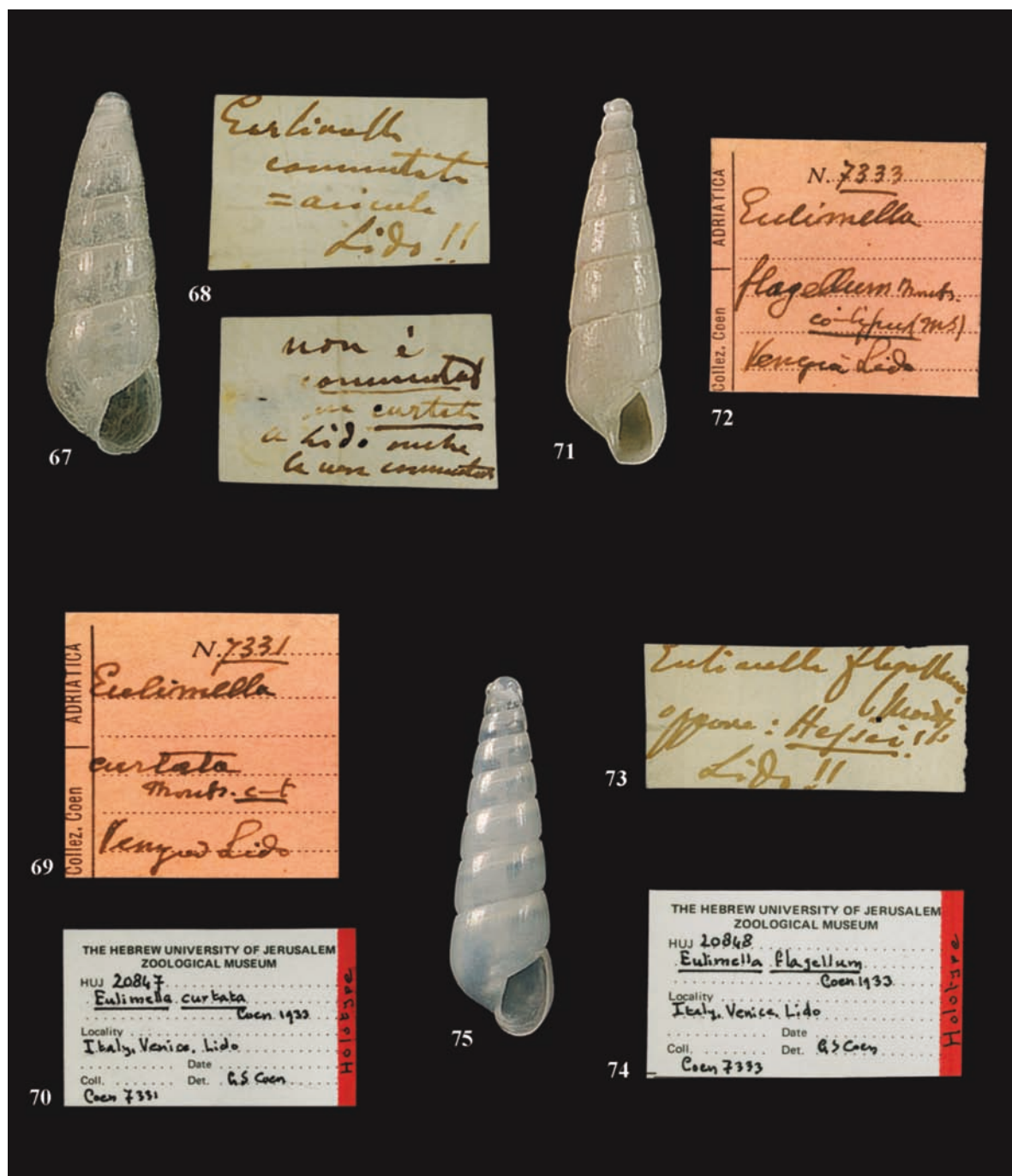
Figure 67. Eulimella curtata Coen's collection, holotype, HUJ 20847, H: 2.7 mm, Venice-Lido. Figs. 68, 69. Original labels. Fig. 70. Museum's label. Fig. 71. Eulimella flagellum Coen's collection, holotype, HUJ 20848, H: 2.7 mm, Venice-Lido. Figs. 72, 73. Original labels. Fig. 74. Museum's label. Fig. 75. Eulimella acicula (Philippi, 1836).

Meaning of the second label not clear, therefore not translated.