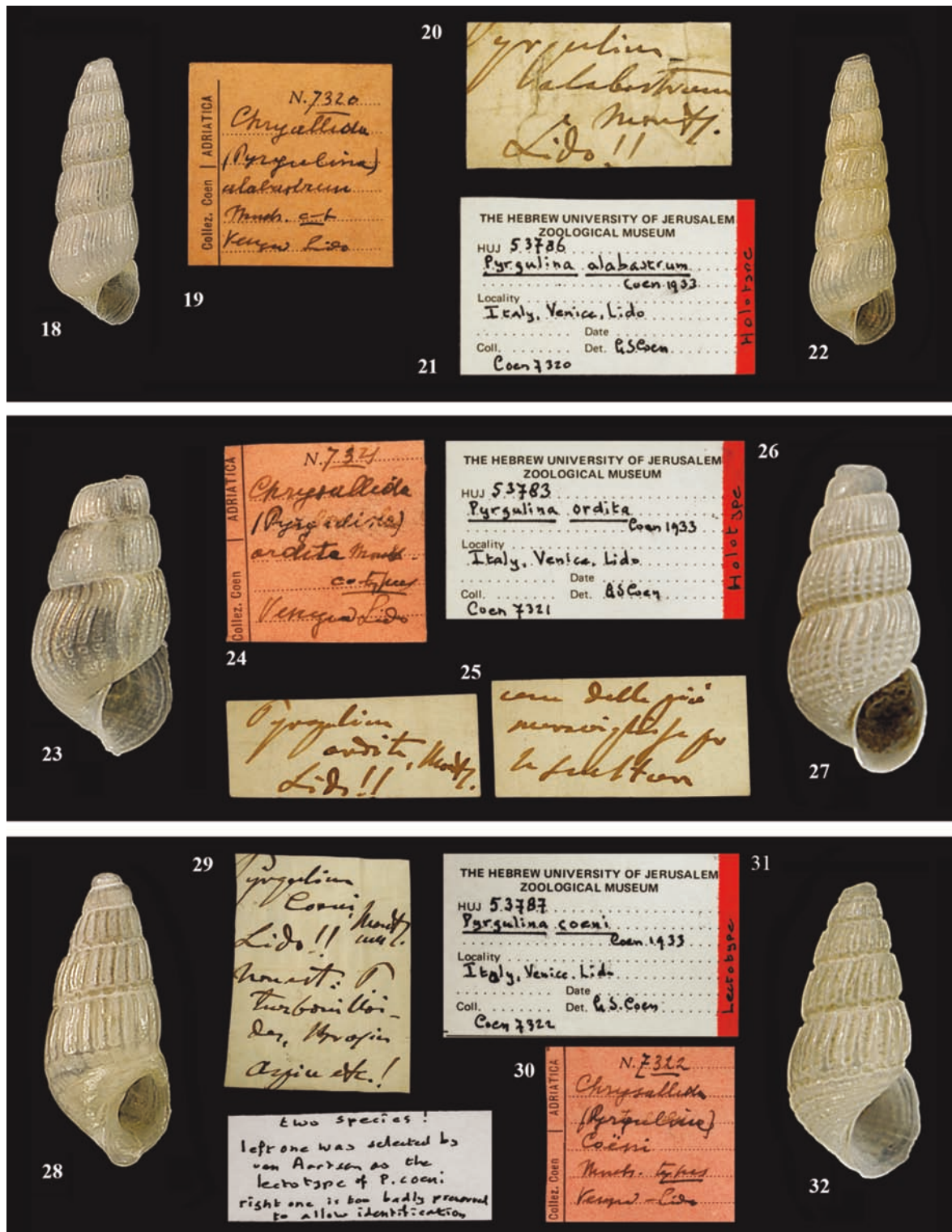
Figure 18. Pyrgulina alabastrum Coen's collection, lectotype, H.U.J. 53786, H: 2.7 mm, Venice-Lido. Figs. 19, 20. Original labels. Fig. 21. Museum's label. Fig. 22. Parthenina indistincta (Montagu, 1808). Fig. 23. Pyrgulina ordita Coen's collection, holotype, H.U.J. 53783, H: 1.6 mm, Venice-Lido. Figs. 24, 25. Original labels. Fig. 26. Museum's label. Fig. 27. Parthenina juliae (de Folin, 1872). Fig. 28. Pyrgulina coeni Coen's collection, lectotype, H.U.J. 53787, H: 1.9 mm, Venice-Lido. Figs. 29, 30. Original labels. Fig. 31. Museum's label. Fig. 32. Partulida incerta (Milaschewitsch, 1916)