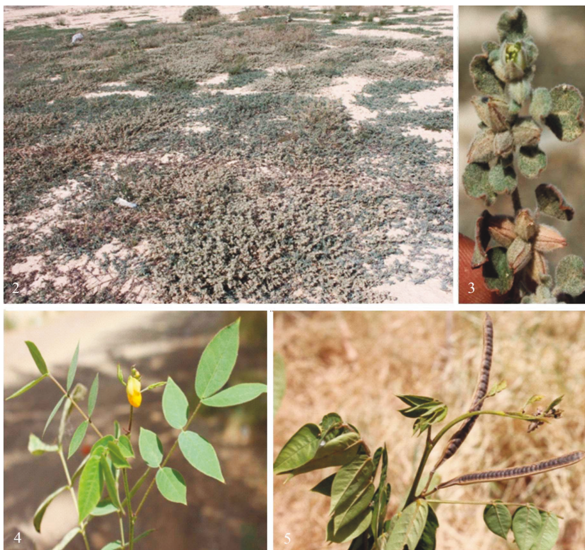
Figures 2, 3. Glinus lotoides : habitat (Fig. 2); flowering twig with fruit capsules (Fig. 3). Figures 4, 5. Senna occidentalis : flowering twig (Fig. 4); pods (Fig. 5).

possibility of spontaneous occurrence of new vascular plants to the country's flora. The increased knowledge of the existence of newly recorded species and their habitats can assist to detect, monitor, measure and predict changes in biological diversity and its conservation.