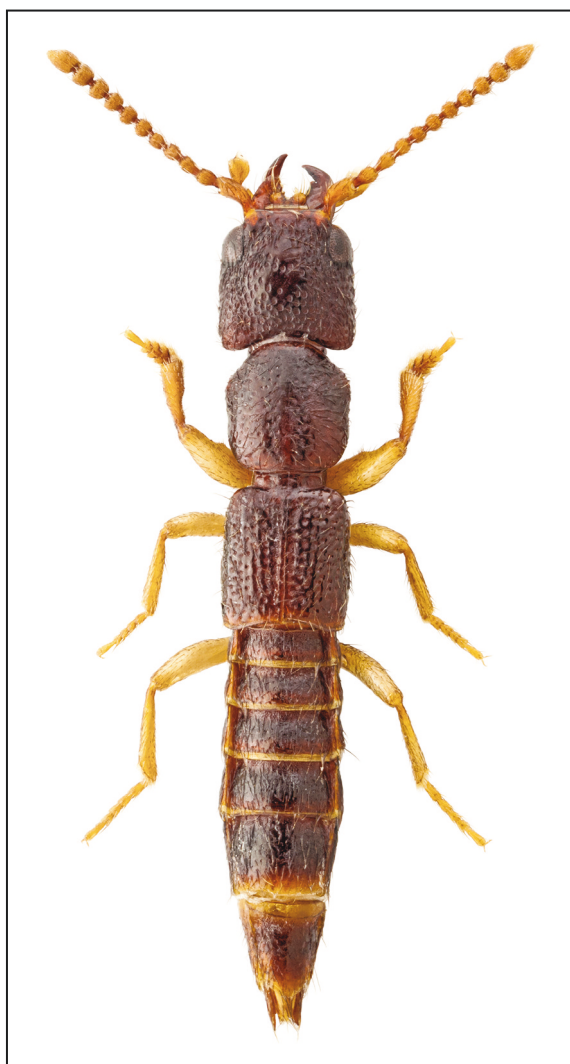
Fig. 1. Stereocephalus agostii n. sp., holotype.

TYPE LOCALITY. Paraguay: Departamento Cordillera, Salto Piraretá, 25°30'S, 56°55'W.