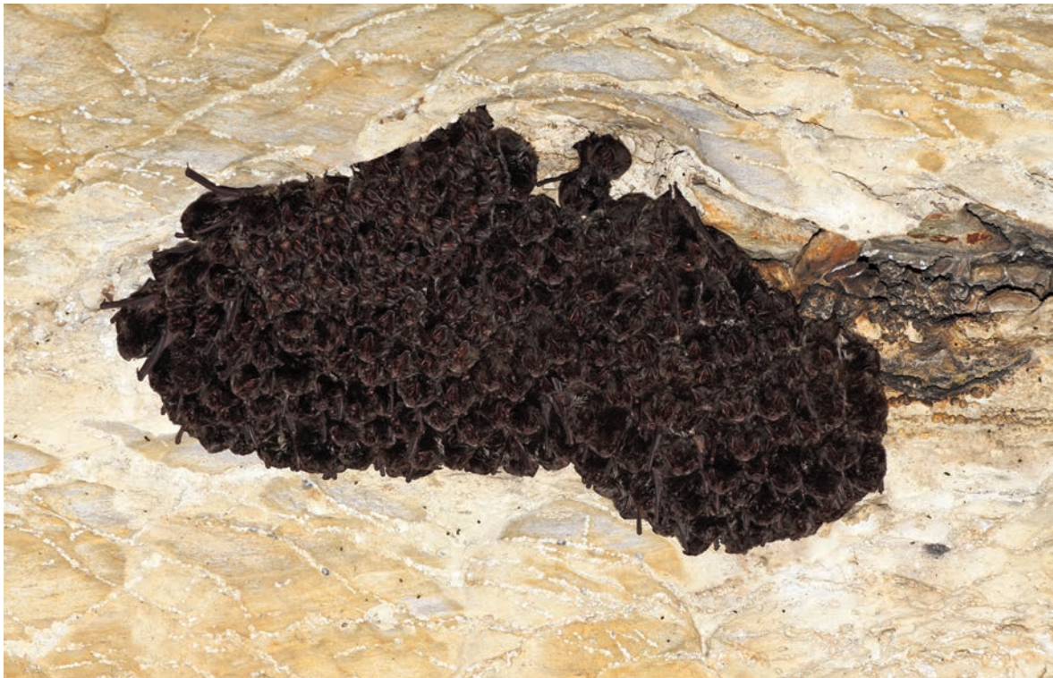
Figure 2. Cluster of 205 Barbastella barbastellus in winter 2012–2013 (cave of Rio Martino, Crissolo, Cuneo, North West Italy).

In 2009 and 2010, captures were also carried out to verify the use of the cave as a swarming site. The captures were made during the nights of 16–17 August, 18–19 September 2009 and 15–16 September 2010, using a harp trap at the entrance of the cave which was active from sunset until 04:00. All individuals captured were identified to species level, and the sex, reproductive status, and age according