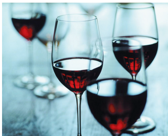
Figure 1. Sicilian wine.