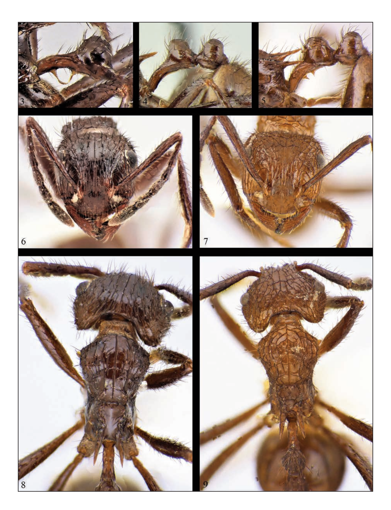
Figures 3-5: Ring-like supetiolar process in M. morettoi n. sp. (Fig. 3); unarmed petiole in M. morettoi n. sp. (Fig. 4); subpetiolar teeth in M. salambo (Fig. 5). Figures 6, 7. Head of M. morettoi n. sp. (Fig. 6); Head of M. salambo (Fig. 7). Figures 8, 9: Mesosoma of M. morettoi n. sp. (Fig. 8); Mesosoma of M. salambo (Fig. 9).