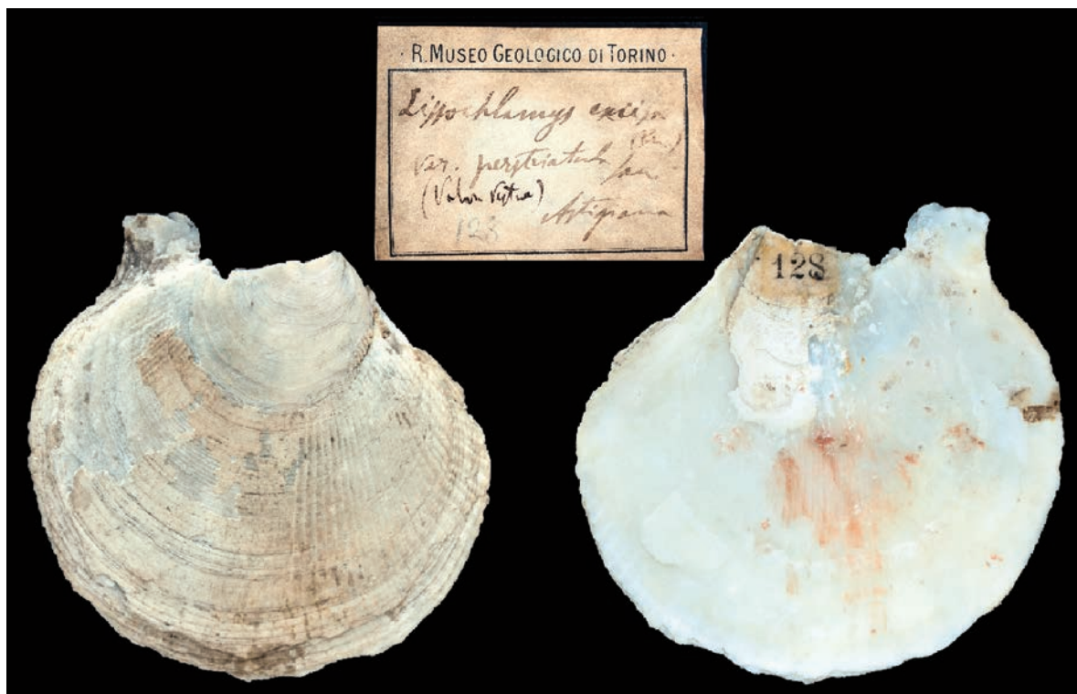
Figure 2. Lissochlamys perstriatula (Sacco, 1897). Lectotipo, Astigiana, Pliocene, L = 34 mm, with original label.