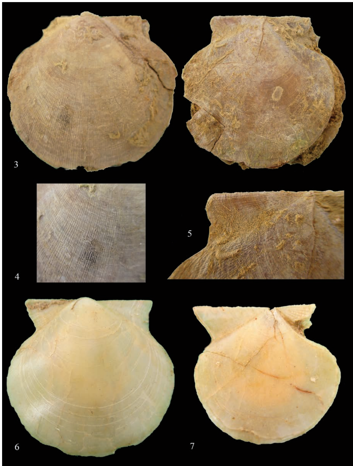
Figures 3–5. Lissochlamys perstriatula (Sacco, 1897). Fig. 3: Lissochlamys perstriatula , Moguer (Huelva, Spagna) Zanclean, L = 55 mm (CBM). Fig. 4: Detail of the left valve sculpture. Fig. 5: Detail of the auricle left valve. Figures 6, 7. Lissochlamys excisa (Bronn, 1831). Fig. 6: Bonares (Huelva, Spagna), Zanclean, left valve L = 51 mm (CBM). Fig. 7: Bonares (Huelva, Spagna), Zanclean, right valve L = 49 mm (CBM).