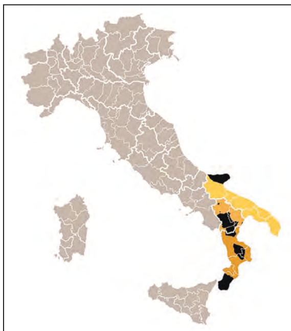
Figure 1. Study areas: in black, the location of the eight sites in southern Italy covered by this study.

The extreme south of Italy is a reservoir of great biodiversity and of a fauna with a rather different composition than the rest of the Peninsula. Entomo-