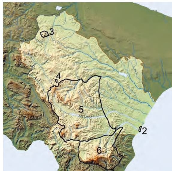
Figure 3. Basilicata (Italy): 2. Policoro Wood; 3. Mount Vulture-Monticchio Lakes; 4. Pantano Lake of Pignola; 5. Central Lucan Apennines; 6. Pollino Massif.

The Pollino Massif includes all the highest peaks of southern Apennines, whose forms have been shaped by the ancient glaciations and which for part of the year are covered by snowfields. The alternation of karstic phenomena and morainic deposits makes the landscape very evocative. Some