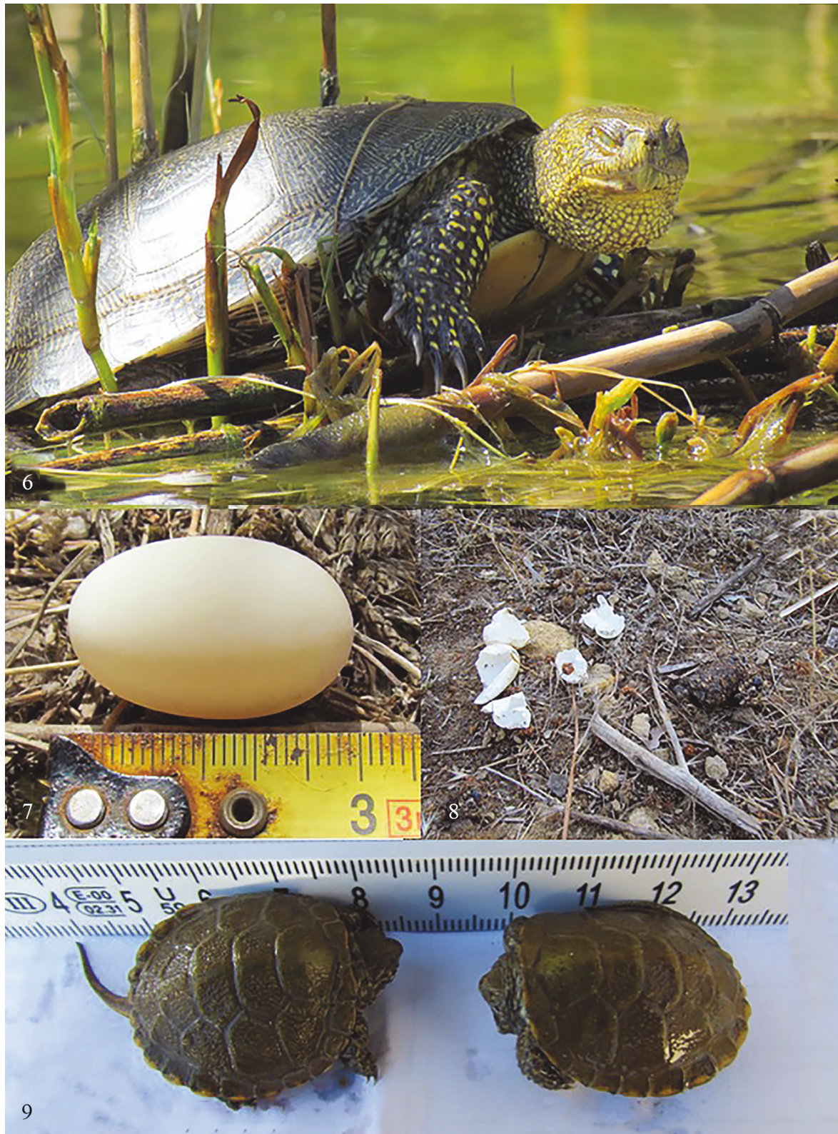
Figure 6. Emys trinacris , adult. Figure 7. Emys trinacris egg. Figure 8. Emys trinacris , holed nest after predation (on the right, fecal rest possibly of Vulpes vulpes ). Figure 9. Emys trinacris , hatchlings.