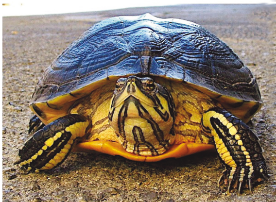
Figure 10. Trachemys scripta , adult.

instance, the presence of the autodrome around the Lake, although its use is under some restrictions, as well as of a peripheral public road close to the autodrome, represent remarkable and serious ecological problems, affecting the conservation status especially of amphibians, due to their explosive migratory and breeding behaviour, with frequent, significant road-killing events. This suggests that effective under-road passages should be built in order to mitigate this problem (Turrisi, 2004 unpubl.; Termine et al., 2008).