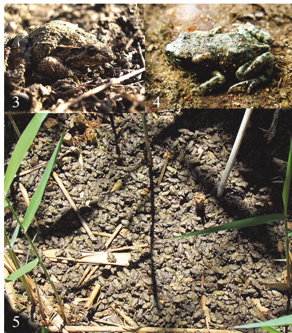
Figure 3. Discoglossus pictus pictus , adult. Figure 4. Bufotes siculus , subadult. Figure 5. Massive aggregation of Bufotes siculus .

The Sicilian Green Toad, Bufotes siculus (Fig. 4), has a north-African origin (having as sister clade B. boulengeri Lataste, 1879), and occupies the western and southern parts of Sicily (with some de-