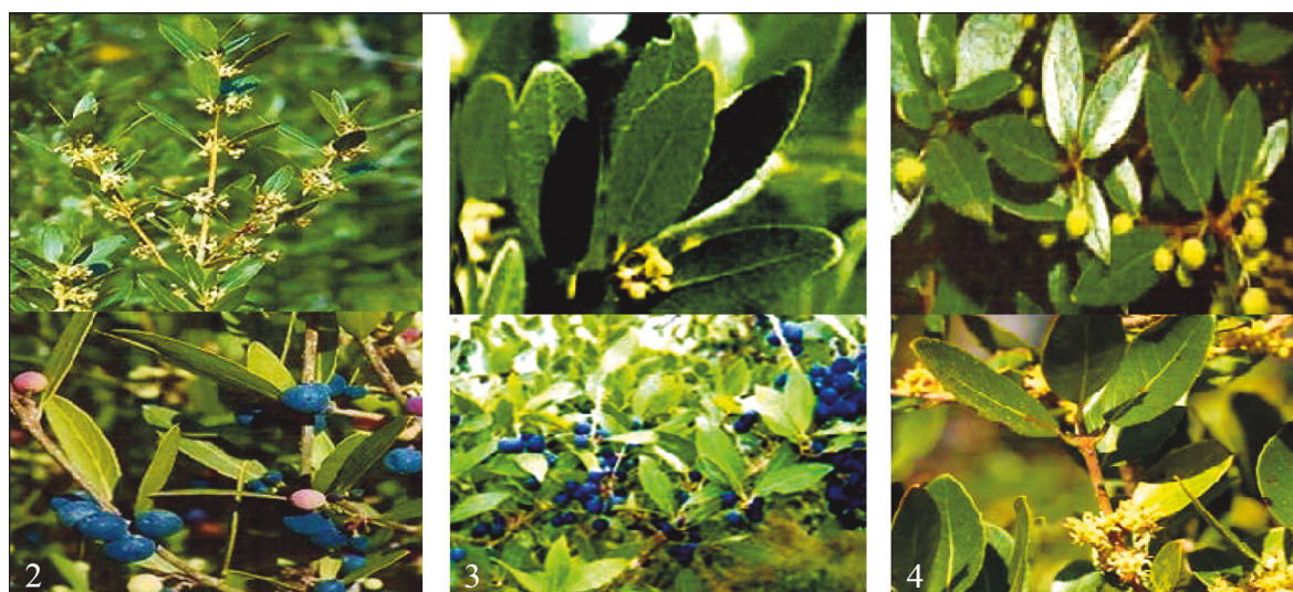
Figure 2. Phillyrea angustifolia from the resort of Beni-Saf, Tlemcen region (western Algeria).