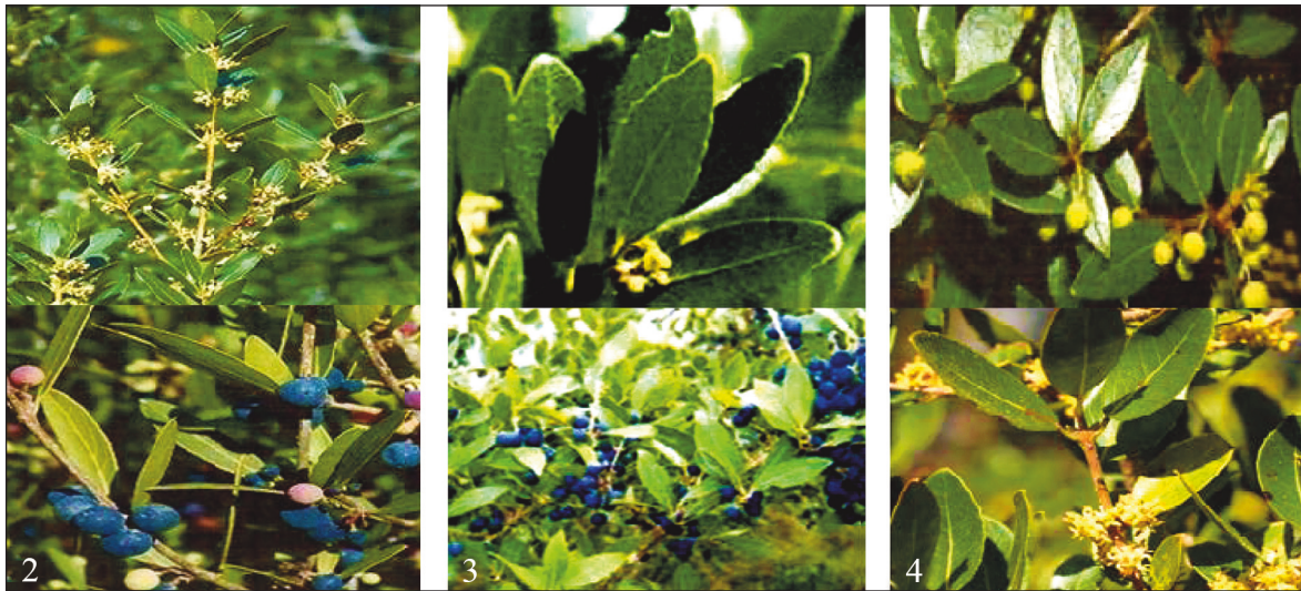
Figure 2. Phillyrea angustifolia from the resort of Beni-Saf, Tlemcen region (western Algeria).