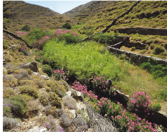
Figure 3. Episkopi brook - 2.5 km far away from the mouth of the stream.