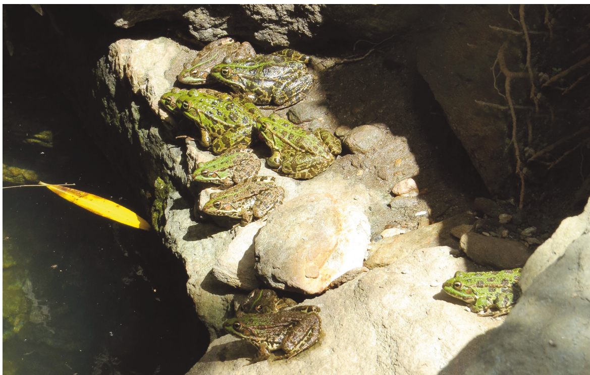
Figure 5. Open water well with Greek marsh frogs nearby the Konasmenou stream.