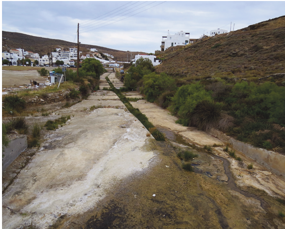
Figure 2. Loutra, former wetland with lagoon aspect of nowadays.