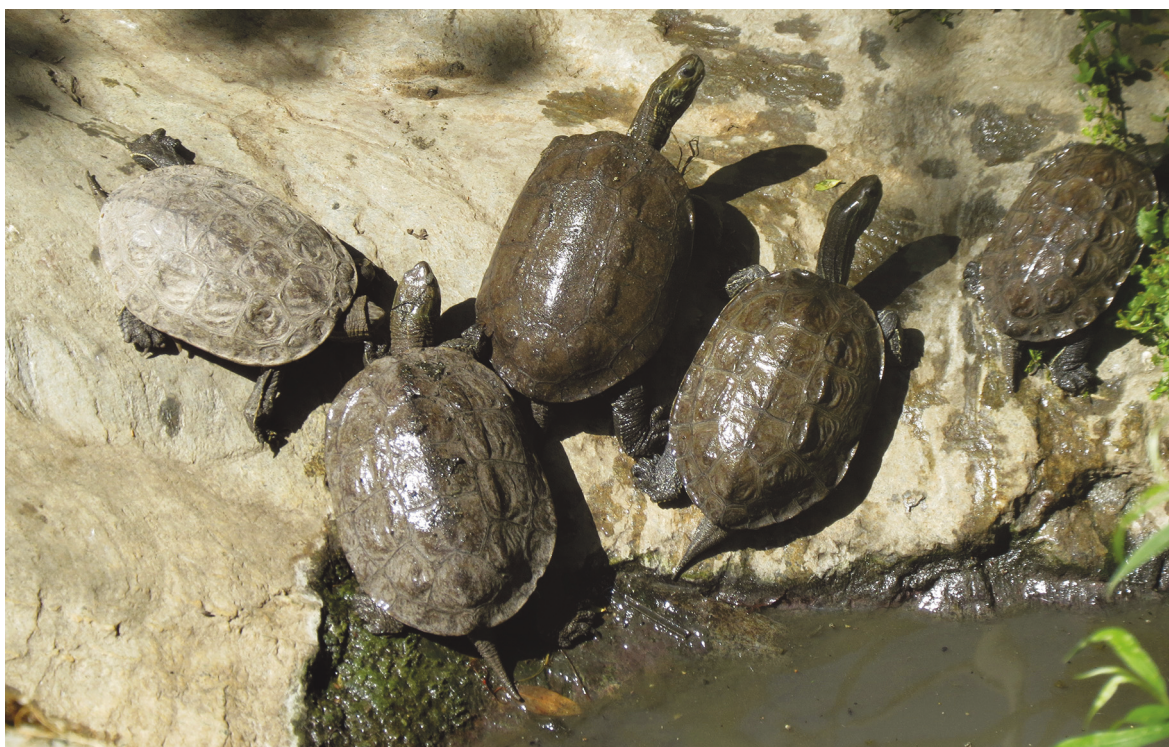
Figure 4. Balkan Terrapin in the stream leads to Apokrousi Bay in waste water of Chora.