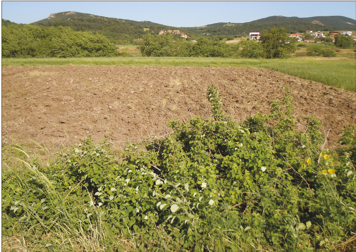
Figure 3. Eastern Evros (north-eastern Greece): habitat of Montivipera xanthina . Note the ploughed soil.

nounced by the ♂♂ moult, which precedes copulation (Nilson et al., 1999). During my herpetological research in the Eastern Aegean Islands, Western Turkey and Northeastern Greece, carried out in the month of May from 1998 to the present, I have come across 172 specimens of Montivipera xanthina and only four exuviae. Six of the specimens found were moulting, but only three adults (1.7%). This may mean either that the moulting occurred in March–April or that it was to take place in the following months. The latter case would argue in favour of spermatogenesis not necessarily being completed during the spring. Moreover, no copulating specimens were noted, only paired or close individuals of the opposite sex. Unfortunately, the specific literature lacks data from observation in nature concerning the reproductive biology of these lowland populations.