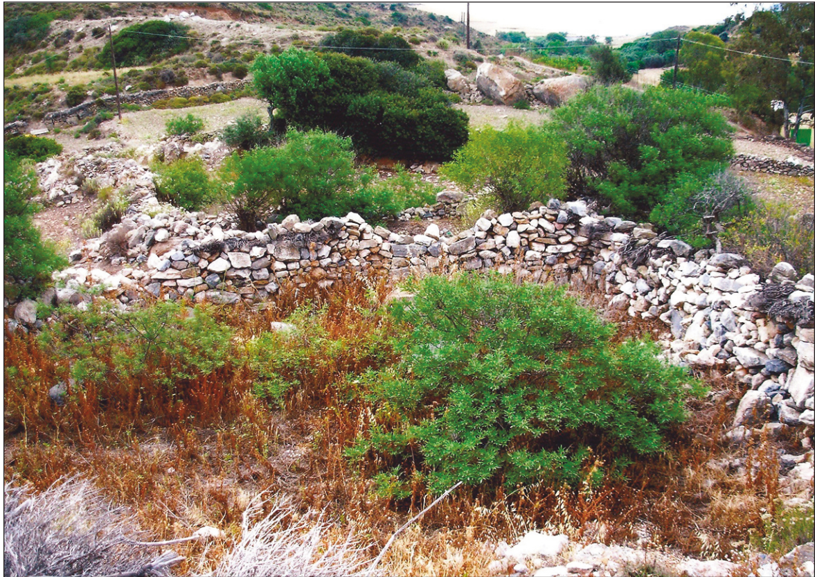
Figure 2. Leros Island (North Dodecanese): habitat of Montivipera xanthina .

It can be seen, however, that environmental conditions in Northeastern Greece are significantly different from those observed in other investigated locations. In both the Evros and Rhodope regions, Montivipera xanthina lives in open, flat areas where the predominant physical factor is therefore ventilation. Winds tend to make the environment less humid, and this condition may perhaps be tolerated by M. xanthina only because Northeastern Greece is notoriously rainy and rich in humid places. The above shows how interactions between the various factors that operate in an organism's environment can prove to be very complex and hard to understand, yet decisive in shaping the adaptation process.