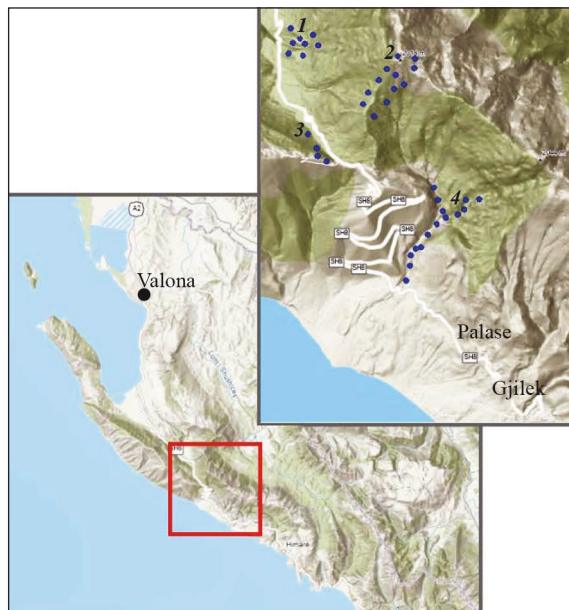
Figure 1. Map of the areas visited during the expeditions. 1. The path of Caesar; 2. Cika Maintain; 3. Panorama; 4. Palasa torrent.