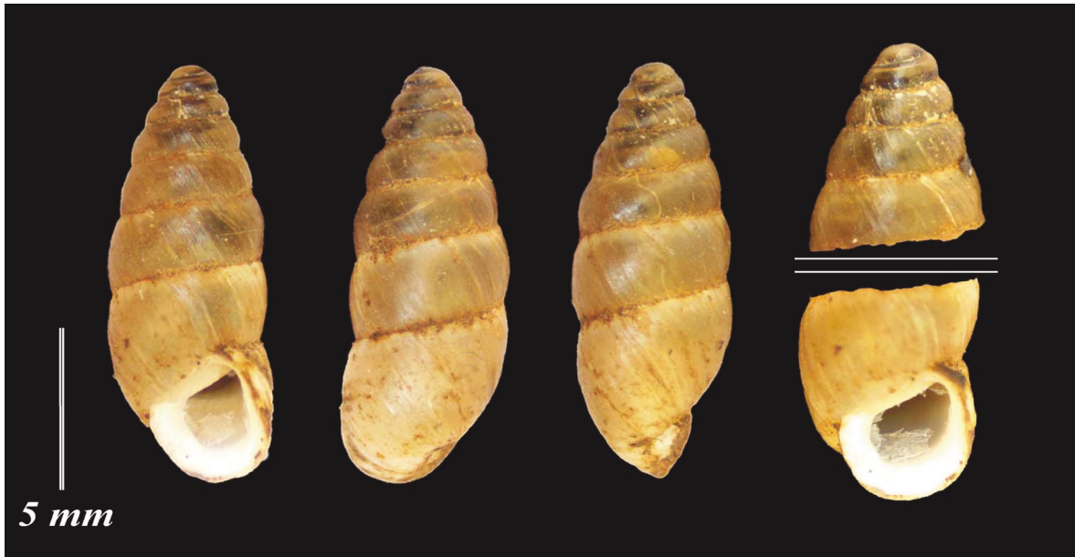
Figure 2. Chondrula (Chondrula) lugorensis Wagner, 1914.