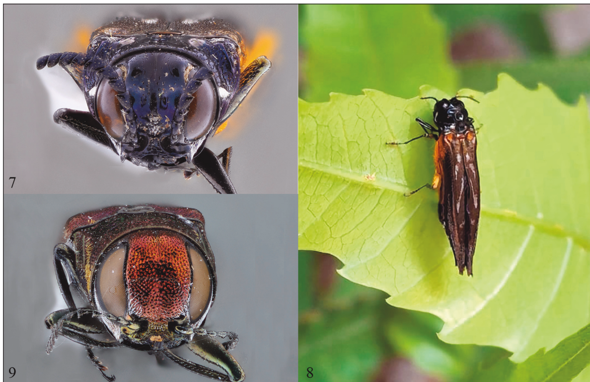
Figure 7. Agrilus butantan n. sp., holotypus female, frons view. Figure 8. Agrilus butantan n. sp., holotypus female, in captivity while feeding on chal-chal leaves. Figure 9. Agrilus ciliaris n. sp., holotypus female, frons view.

metafemoral pubescence make it unmistakable and unmatched in global fauna.