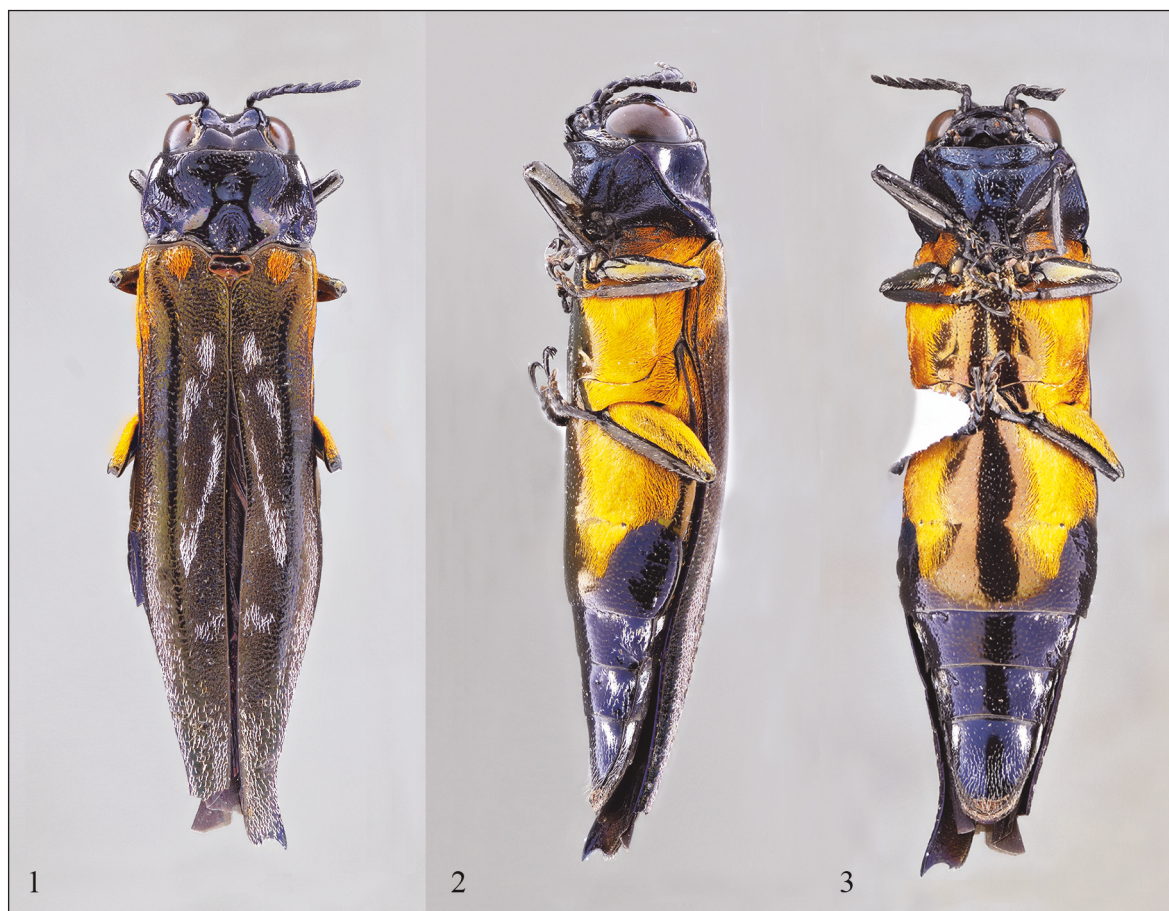
Figures 1–3. Agrilus butantan n. sp., holotypus female from Brazil, Butantan Park Institute.

Scutellum large, with a thin, barely visible transverse carina. Elytra elongated, surpassing the abdomen. Caudiform apices, diverging, thick, concave, each forming two points, the inner one obtuse, while the outer one is more acuminate and