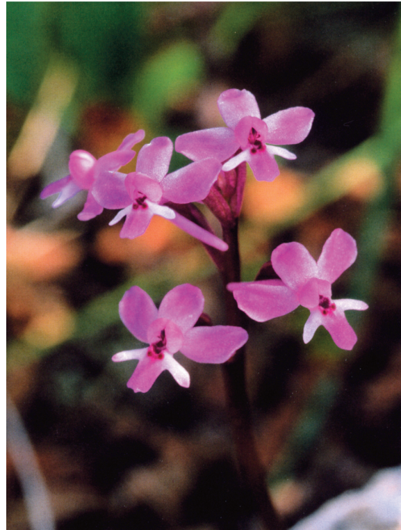
Figure 3. Orchis brancifortii , endemic to Sicily, S-Calabria and Sardinia.