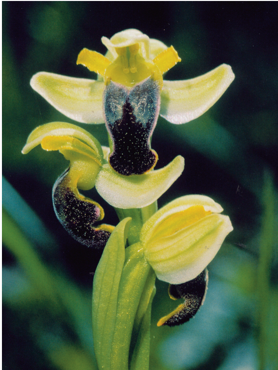
Figure 2. Ophrys pallida , endemic to Sicily from the Madonie Mountains to westwards.