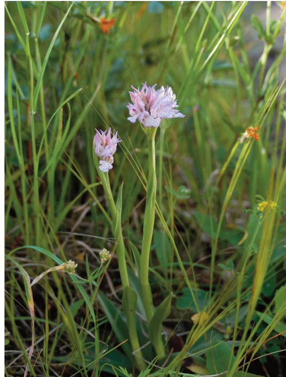
Figure 1. Orchis commutata , a tetraploid vicariant of O. tridentata ; distribution: Sicily.

The occurrence of these geophytes, together with a special terrestrial vertebrate palaeofauna, and other local endemic or rare plant species (Brullo et al., 1995) show that the Iblei Mountains were an island during the Middle Pleistocene (Guglielmo & Marra, 2011). In that period, the rest of the present Sicily was in part submerged, and in part, northwards, occupied by another large island, including the mountainous ranges between Messina and Tra-